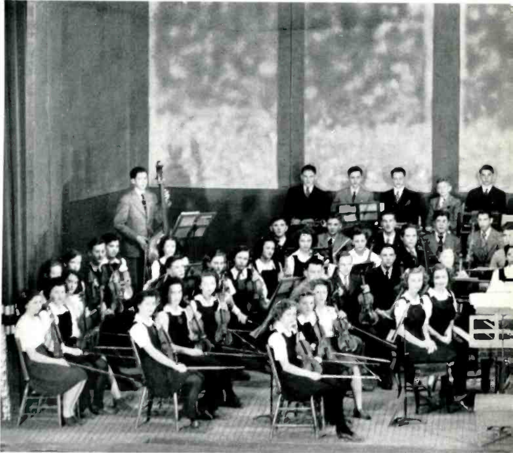
Names of Performers