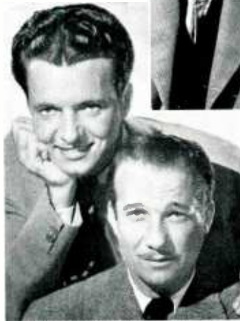
Upper Picture: Lum and Abner in character.

The opening announcement of the programme sponsored by Miles Laboratories Limited is always the introduction to some amusing doings "down in Pine Ridge", where the inimitable Lum and Abner have their sometimes prosperous and often not-quite-so-thriving rural general store. As side lines the pair and their associates may be building a rocket ship or struggling against local competition in the motion picture show business. Whatever their latest activities may be, they are always good for laughs.