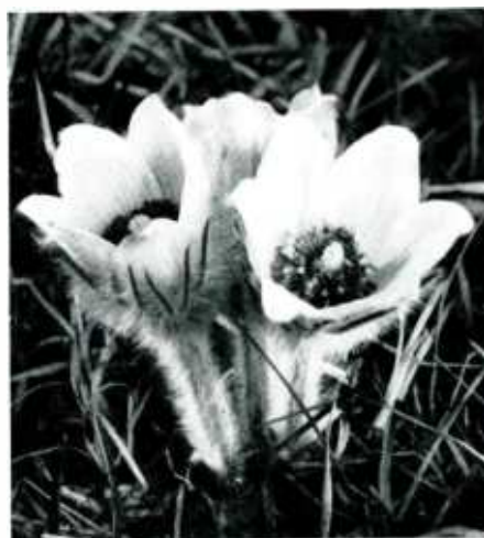
Prairie Anemone (Crocus) Floral Emblem of Manitoba