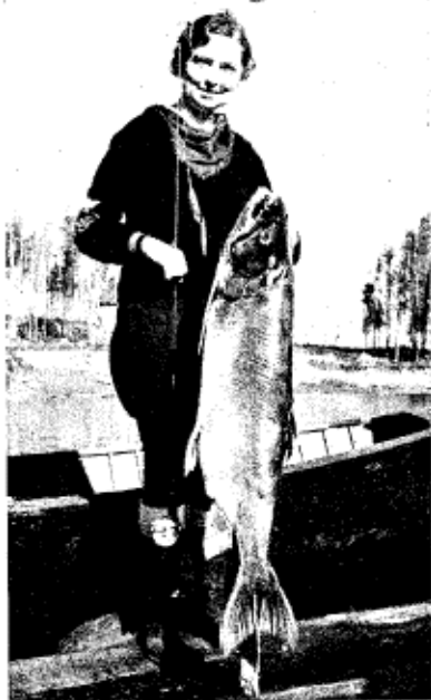
A 33-lb. Lake Trout

Manitoba's extensive lakes and streams are a paradise for fishermen. There are many varieties of fish, including lake trout, northern pike, yellow perch, mooneye, pickerel, goldeyes, grayling, rock bass, Arctic charr and speckled trout. The last-named is plentiful in many of Manitoba's northern waters. In the Nelson River and