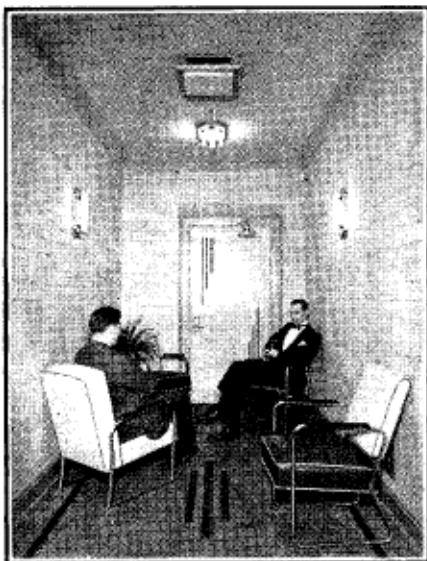
Entrance to Studios—Artists' Waiting Room

This is a neat cubicle wherein artists and speakers about to address the world at large may enjoy repose and a little time for that quiet contemplation which is an excellent preparation for facing the microphone. The lighting is supplied by translucent tubes on wall and ceiling brackets, combining yellow and red to diffuse a restful rose-colored glow which adds much to the comfort of the place. We see a door to the left of the one by which we entered and another to the