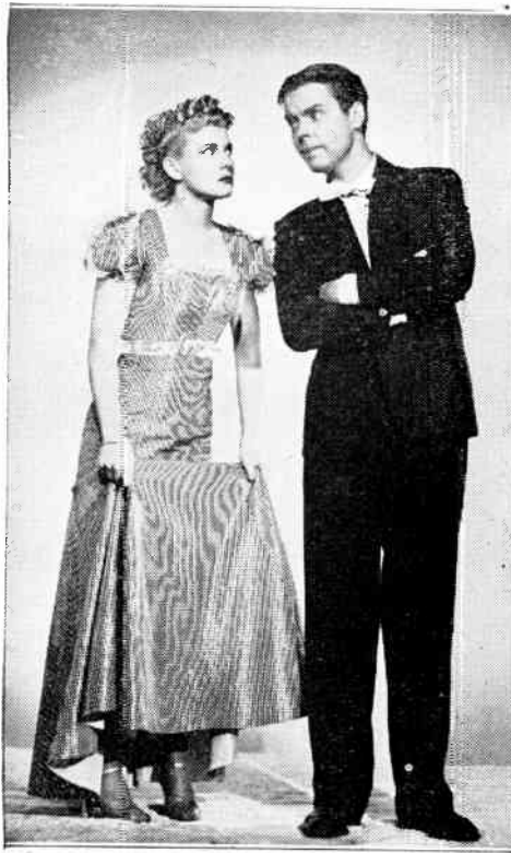
Penny Singleton, plays the part of Blondie. Arthur Lake, plays the role of Dagwood