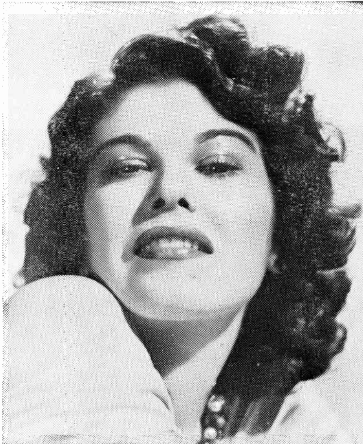
Betty Lou Gerson, one of the leading players in the NBC Chicago studios, has added a new laurel to her growing list of triumphs by winning the title role in the widely-popular serial, "Story of Mary Marlin", heard daily over the NBC-Blue Network. She also has the leads in "Midstream" and "Arnold Grimm's Daughter."