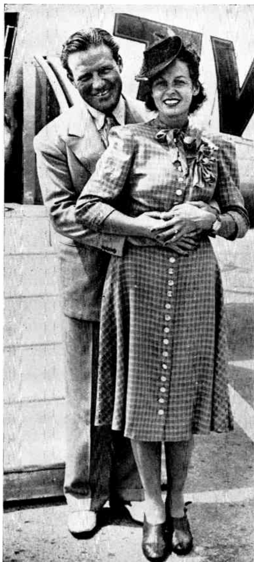
Horace Heidt and his wife arrived in Hollywood by plane, where Heidt and his orchestra are making a picture based on his "Pot of Gold" program.