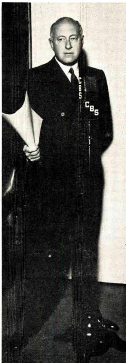
CECIL B. DEMILLE

"There are 15,000 men storming that hill, sir."