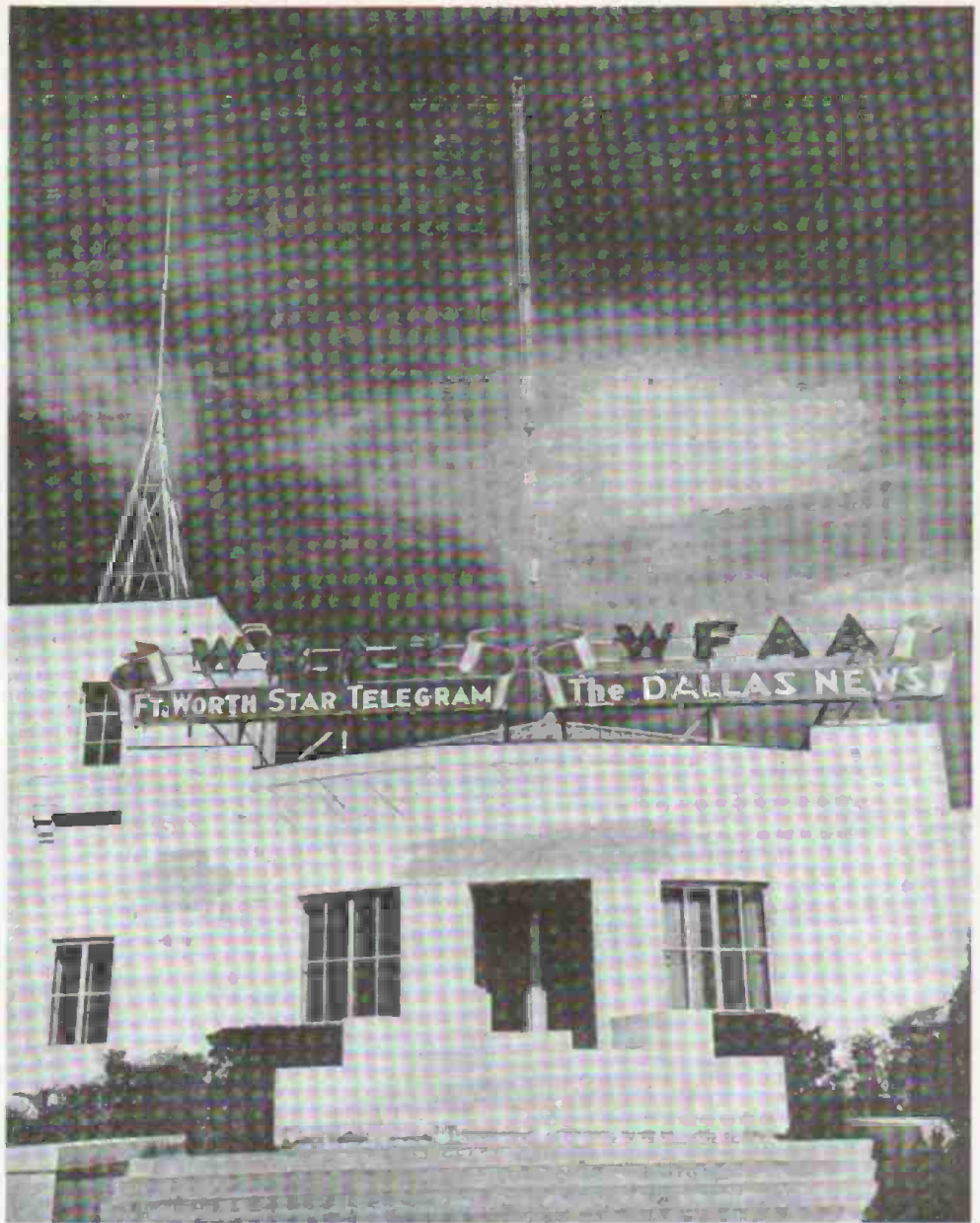
The WFAA transmitter which occupies 50 acres near Grapevine, Texas has the tallest radio antenna in the state, soaring 653 feet into the Texas skies.

There is KFAA, the WFAA mobile unit short wave transmitter, which enables the station to set up broadcasting facilities simply by driving a deluxe