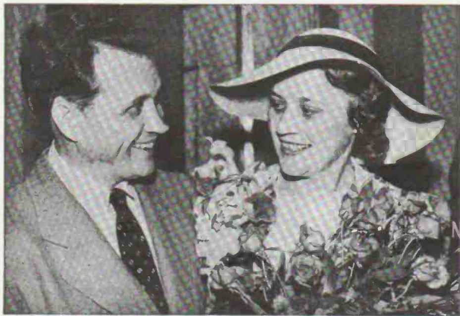
Fibber McGee and Molly

Of the other headline names you might expect to find on the vacation list,