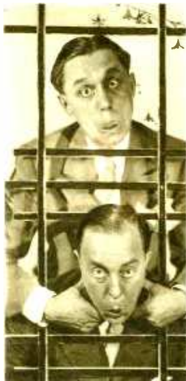
Ole Olsen (lower) and Chic Johnson, those two funnee men whose antics keep you in those pleasurable stitches during the Fleischmann Hour.