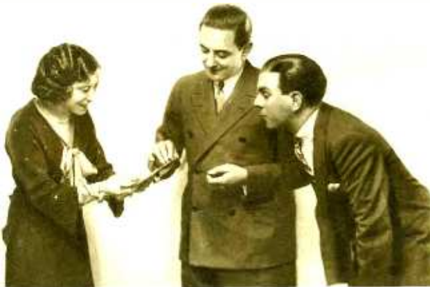
Another picture of them doing their radio stuff. The gentleman picking the card is Guy Lombardo.