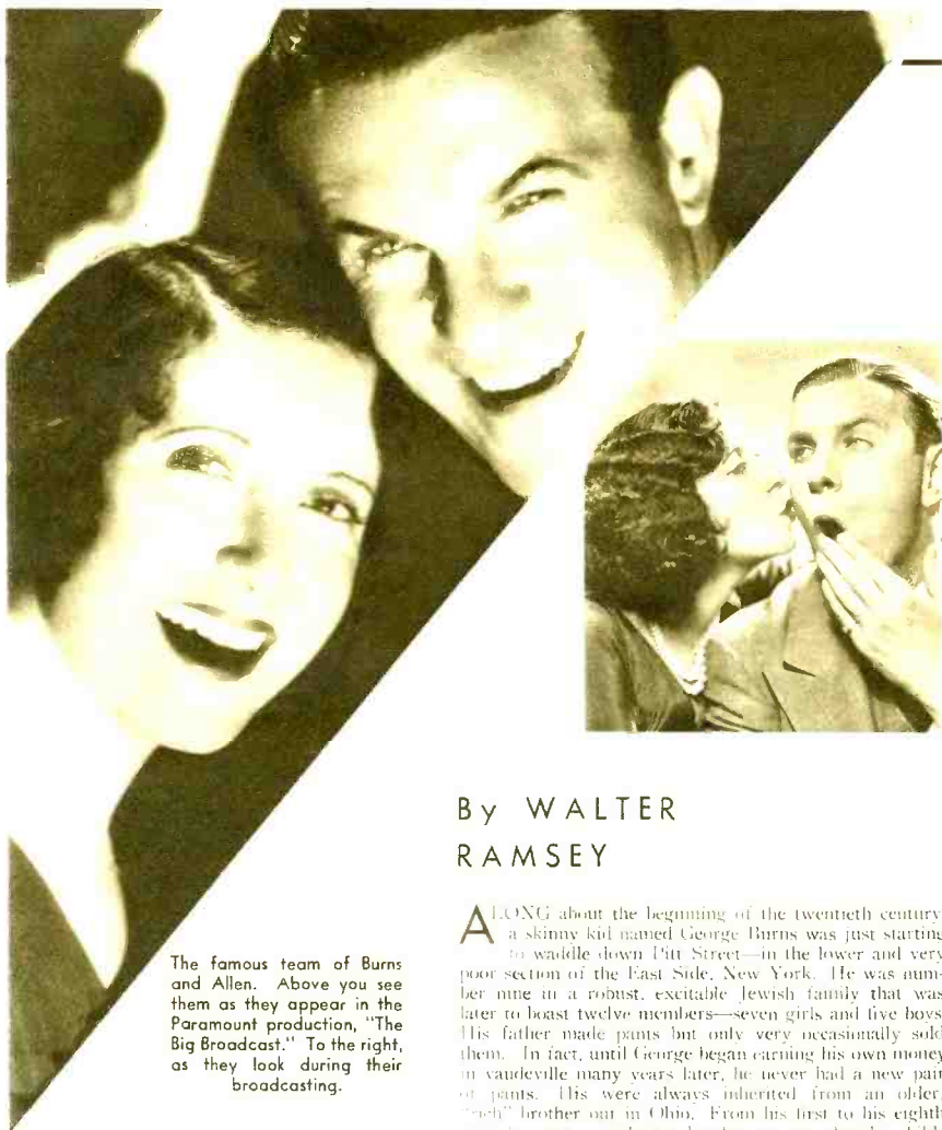
The famous team of Burns and Allen. Above you see them as they appear in the Paramount production, "The Big Broadcast." To the right, as they look during their broadcasting.