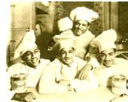
The Mills Brothers, who can imitate an orchestra so well that even visitors to the studio swear its done with hidden instruments. You hear them on the fifteen-minute Crisco program.

REMEMBER those "Easy Aces" programs? Or don't you play bridge? Well, it seems Mr. and Mrs. Ace make the same sort of blunders in life that they do in their skits. They were planning a trip to California from New York via the Panama Canal. So, the Aces ups to the mike and tell their gaga public that they'll send a postal to