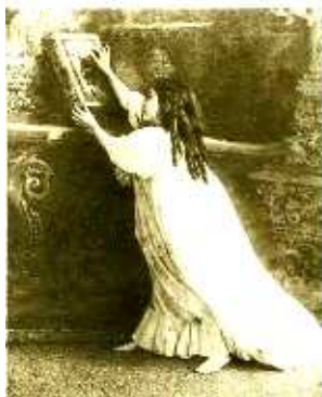
(Below) Gracie Allen in what was then considered a pretty snappy pose. She was five at the time.

What a charming story, this tale of the beginnings—yes, the very earliest beginnings—of the famous team of George Burns and Gracie Allen. George was born in lower Manhattan. Gracie in San Francisco. Yet their paths crossed, with dramatic consequences