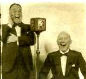
Billy Jones and Ernie Hare, whose clever jokes and amusing songs have kept you listeners-in happy these past years and years on NBC programs.

every fan who wants one. And did the fans lap-it-up? To date, Mr. and Mrs. Goodman Aces have had to buy, pay for, and mail over ten thousand of those cheery little "Having-a-grand-time-wish-you-were-here" pasteboards.