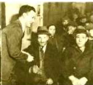
Phillips Lord, better known as Seth Parker, visited the New York Bowery not long ago and gave cheer to some of the unfortunate derelicts.