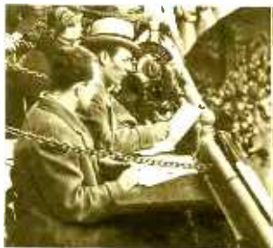
Ted Husing ready to broadcast a football game. 'Tis said that the Eastern colleges will prohibit the broadcasting of their games this year. Isn't that mean?