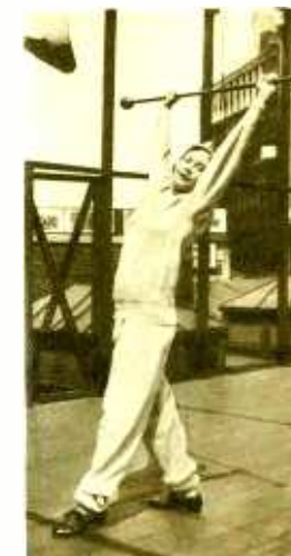
The Countess is a great believer in athletics. Can you imagine Royalty exercising in public on the roof? Another of her departures from old Spanish custom.