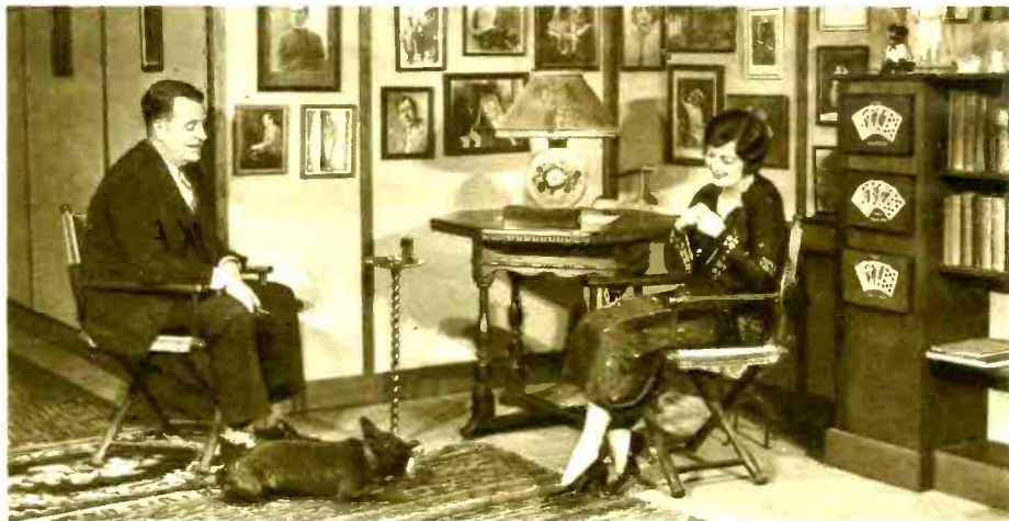
The Crumits at home with the purp. All those photographs are pictures of stage celebrities, friends of the Crumits.

stopped make-believing . . . and found that parson . . . and built that home. . . .