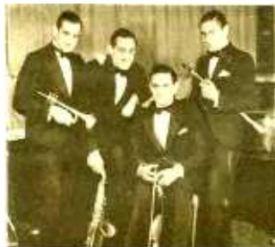
The four Lombardos whose concerted efforts have made Guy Lombardo and his orchestra world famous. That's Guy sitting down with the fiddle.