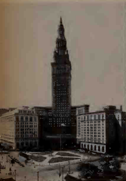
The office building which houses Burt's, Inc.—the Terminal Tower. Burt's occupies the entire sixth floor.

garded as foolhardy. He left busy Euclid Avenue for the present Terminal Tower location. It was a comparatively remote site in an office building location. At first, BURT's occupied 4,000 square feet on the sixth floor of the building. But the store clicked immediately and began to expand to its present 78,000 square feet of floor space. This is nearly the entire sixth floor of Cleveland's Terminal Tower, and also a four-story building nearby which holds BURT's modern furniture store. This, more than anything