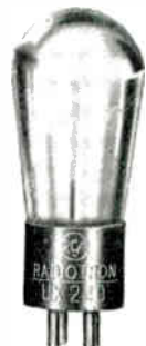
UX 240 (High-Mu) De- tector Amplifier