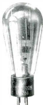
UX 281 Half Wave Rectifier