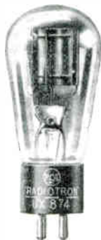
UX 874 Voltage Regulator