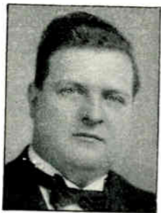
Milton J. Cross National Broadcasting Company WEAF-WJZ New York City

D OWN New York way they rate Milton ace high. In 1929 he won the gold medal of the American Academy of Arts and Letters for speaking the English language more nearly as it should be spoken than any other announcer. The ladies swear by him and no one ever swears at him. His large and benign presence makes friends for him both on and off the air and if there is a drop of conceit in his make-up no one has ever discovered it to date.