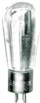
UX 280 Full Wave Rectifier