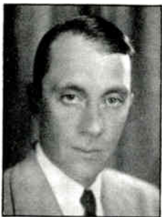
Graham McNamee National Broadcasting Company WEAF-WJZ New York City

A ND, we might add, of The World! For wherever radio has gone Mac's voice has gone with it and his watch chain is heavy with the keys of the country's important cities, bestowed on him by admiring mayors. When Mac goes to a town to make a personal appearance the entire population turns out to welcome him and yet there is no more modest celebrity in the country than this NBC star who looks on every broadcast as just another chance to make his best, better!