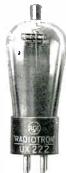
UX 222 Radio Frequency Amplifier