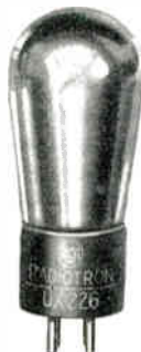
UX 226 Amplifier