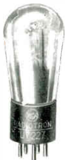
UY 227 Detector— Amplifier