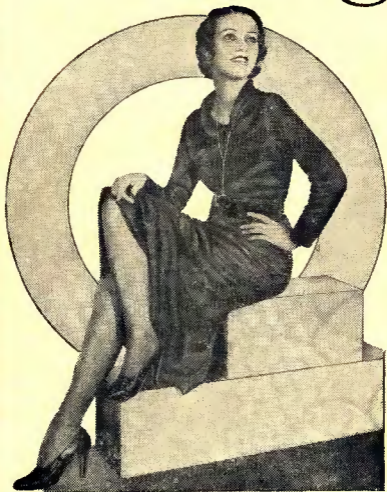
JANE FROMAN (Story on Page 31)