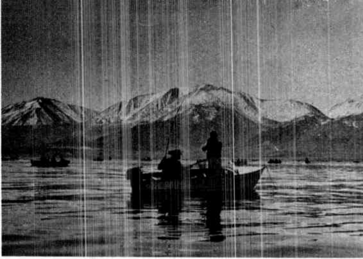
▲ THIS FISHERMAN'S PARADISE is one of two places that KTTV's "Destination Unknown" will visit on Monday night, September 14.