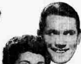
The Todds 2:00 to 2:30 p.m. daily