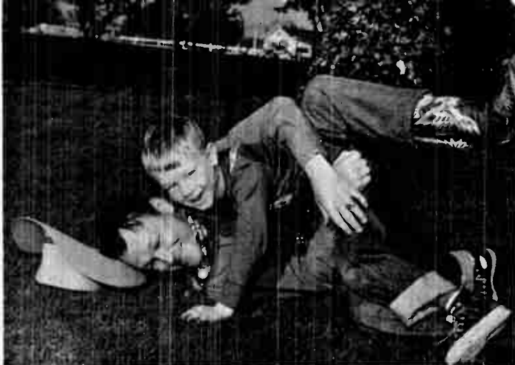
▲ ROY ROGERS AND HIS DUSTY won't have much more time for this kind of fun. Dusty returns to school and Roy will be hard at work on both his radio and TV shows.