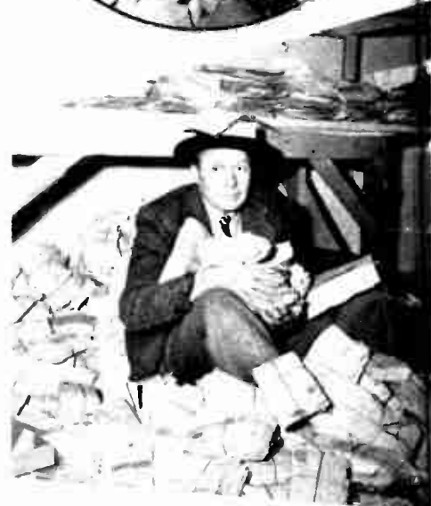
▲ TOP: JACK WITH HIS DAUGHTER, Joan. She is now quite the young lady and thinking in terms of romance. Below: Jack buried under an avalanche of letters sent in on his famous "I can't stand Jack Benny because" contest. Remember that one?