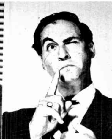
DONALD O'CONNOR is loaded— with talent. ALAN YOUNG is charitably minded. JEROME THOR is that solid foreign type. SID CAESAR tells jokes before Miltie.

exciting man. Of all the nice boys on TV here are my favorites.