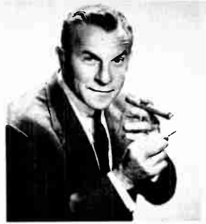
GEORGE BURNS has Gracie

Marie Wilson is certainly a daring woman. Who else would stick her neck out and select