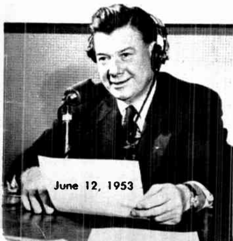
ARTHUR GODFREY is relaxed even with money.