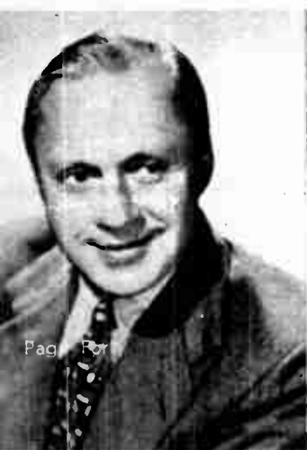
BOB HOPE benefits everybody.