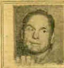
Wild Red Berry: