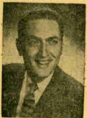
Hear music and humorous comment by one of Southern California's most popular personalities.