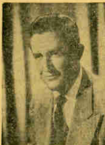
Don't miss this complete early morning news wrap-up from Columbia Square on the . . .