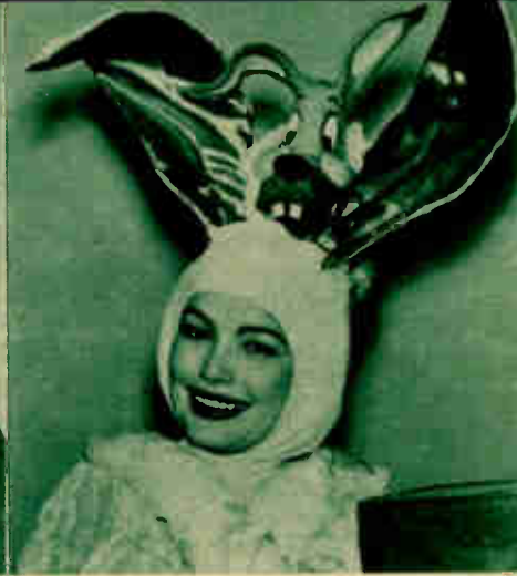
↑ "WACKY RABBIT," of KNBH's "Adventures of Patches" fame, and a friend . . . he thinks.