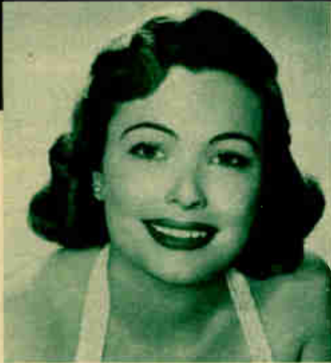
↑ LOIS COLLIER , as she appears on the Sunday night KNBH series "Boston Blackie."