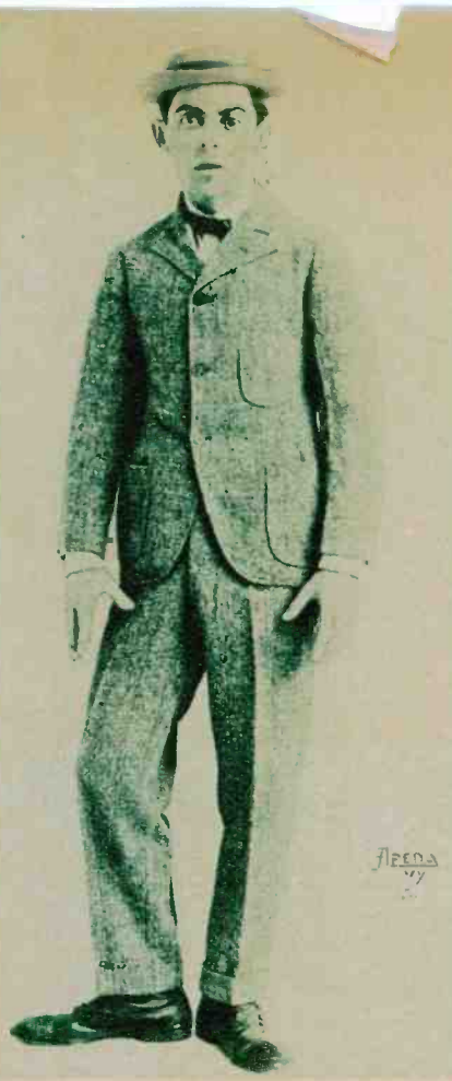
▲ BY 1918 IT WAS "Eddie Cantor—Comedian." If you think he wasn't a comedian in the Ziegfeld Follies of that year, look at the hat and the shoes.