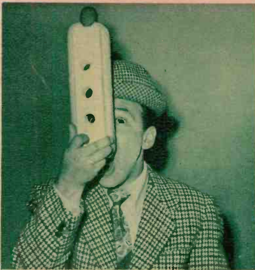
▲ IF ONE OF YOUR PROBLEMS has been eating a hot dog and watching a football game at the same time, worry no more! Pinky Lee shows the solution.