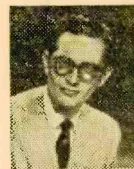
ROBERT Q. LEWIS

The name's the same—and so is the game, on ABC-TV's offering which finds a panel guessing the identity of mystery guests who bear the same moniker as a famous personality. But who cares? There are only so many