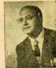
ABE BURROWS (Moderator)

variations of the old "animal, vegetable or mineral" routine, and when any one thereof is dressed with a panel like Abe Burrows, Joan Alexander and Meredith Willson, it's worth watching.