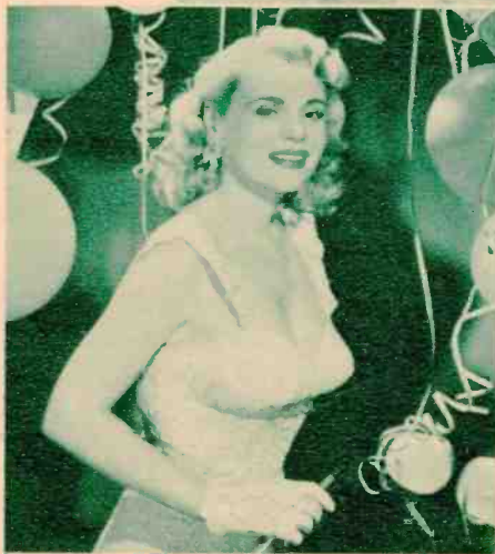
← MARIE WILSON does not object to the comments made about her curvaceous figure.