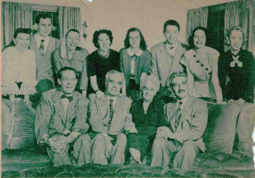
Carlton E. Morse Is the Father of

EACH WEEK Carlton E. Morse writes what amounts to half of a full-length motion picture.