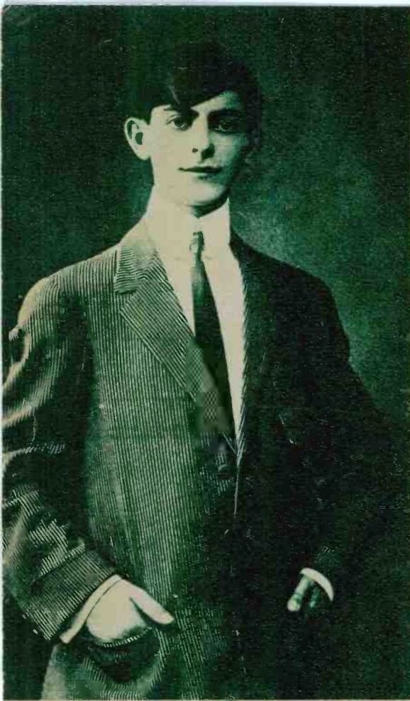
▲ THIS SNAPPY DRESSER with the boyish bob and the striped coat is none other than "Eddie Cantor—Dialectician" as he was billed when embarking as a single act in vaudeville. The year—1910.