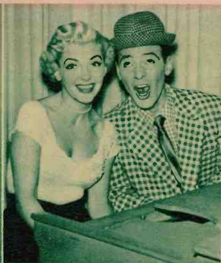
▲ VIVIAN BLAINE, popular Broadway singer, is starred with Pinky on the show named, appropriately, The Vivian Blaine-Pinky Lee Show. It is seen three nights weekly on KNBH.