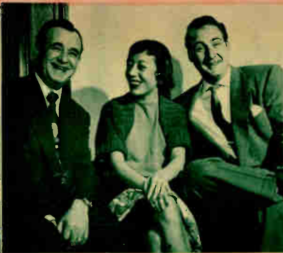
▲ IT'S EASY TO IMAGINE a good laugh has just been provided, when Producer Max Liebman, Imogene Coca and Sid Caesar — the latter stars of "Your Show of Shows"—get together.