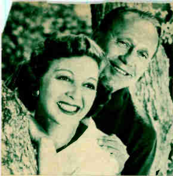
▲ MARY LIVINGSTONE , spouse and veteran radio sparring partner of CBS-TV's Jack Benny, made her TV debut with Jack last year.