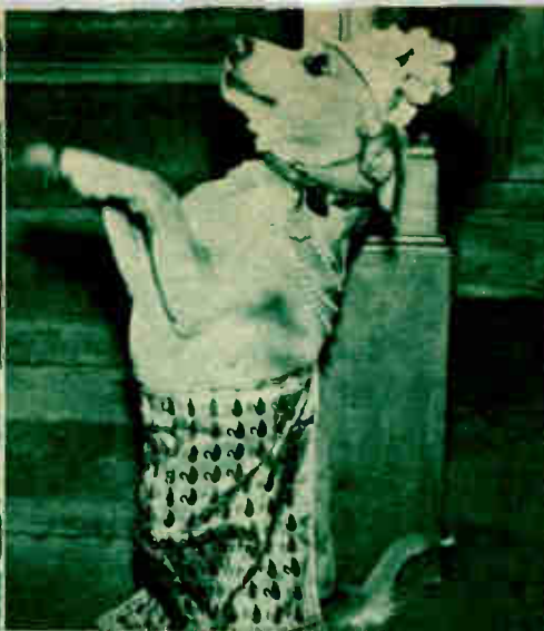
▲ THE WINNAH! This is the costume that "Goldie," a participant in KTTV's Calo "Mutt Show," donned to walk away with a best-dressed prize.