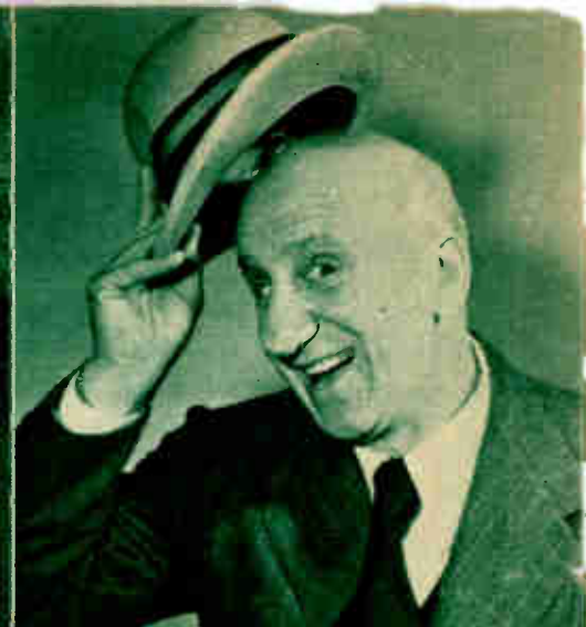
▲ IT'S THE PERSONALITY that brought Jimmy Durante not only a Peabody Award for television entertainment, but the hosannas of both public and critics.