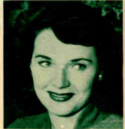
▲ POLLY BERGEN: The red-haired beauty from Tennessee lived in twenty-eight states and went to ten schools during one year. She began singing at the age of fourteen, but it took an alert agent to spot her on TV and bring her to Hal Wallis's attention. She is now under contract to the producer. Polly is five feet five and a half inches tall, is married to Jerome Courtland.