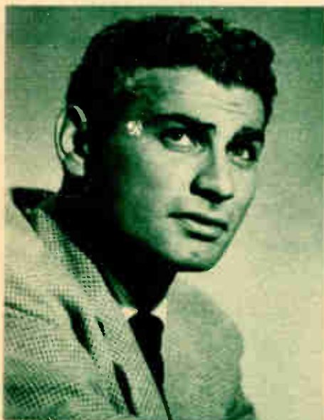
▲ NO STRANGER TO RADIO is Jeff Chandler, whose film work partially resulted from such fine air chores as his role of "Mr. Boynton" in CBS's "Our Miss Brooks" series and who recently made his "Suspense" debut.