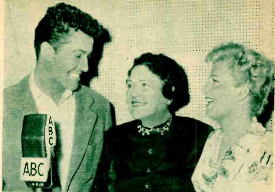
▲ ONE OF FILMTOWN'S favorite romantic teams, Farley Granger and Shelley Winters, guested on Louella Parsons' Sunday evening ABC show recently.