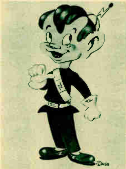
▲ HE WAS INVISIBLE until this sketch, a composite based on 25,000 drawings submitted by youngsters from every state in the Union, brought to light "Sparky," other half of the "Big Jon and Sparky" combo on ABC's "No School Today" broadcasts.