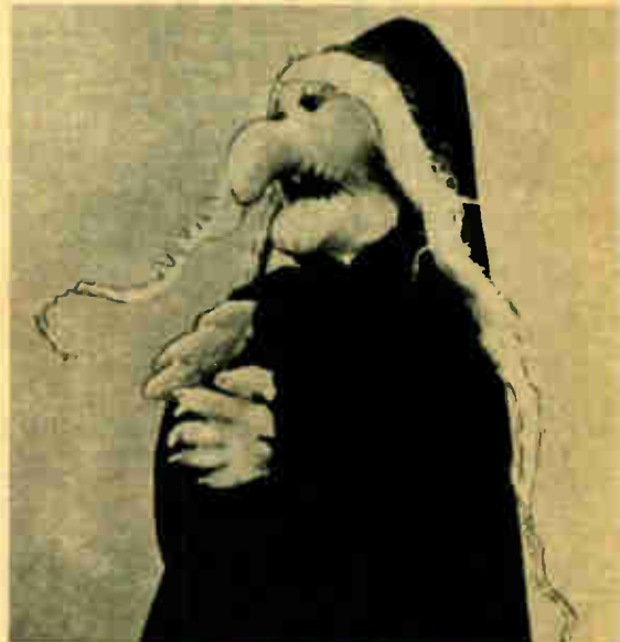
BUELAH WITCH MADAME OOGLEPUSS