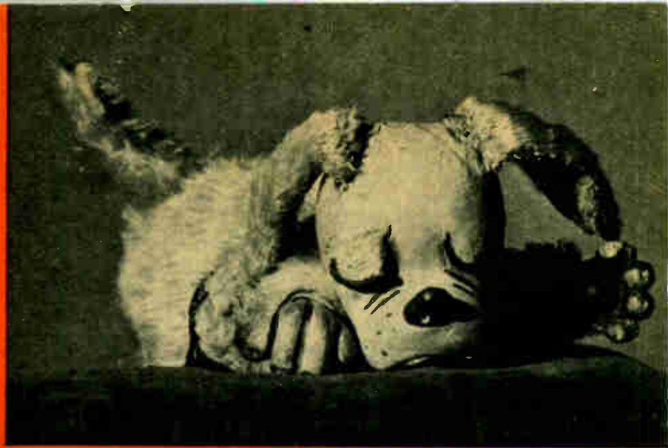
▲ HERE IS "LUCKY PUP" THE WAY YOU SELDOM SEE HIM —sleep. Each Sunday at 6:45 p.m., on KTTY's Channel 11, "Lucky," "Foodini," "Pinhead" and all the other wonderful Bunin puppets sally through a series of wide-awake adventures.