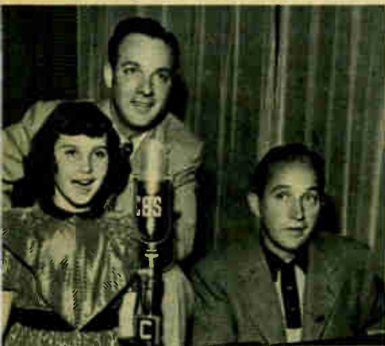
▲ THREE CROSBYS —Bob, his ten-year-old daughter Cathy, and her Uncle Bing—formed a rare trio on recent Groaner airshow.