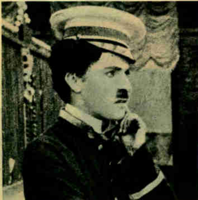
CHARLES SPENCER CHAPLIN, WHO WON MILLIONS and lasting fame from behind the mask of the perennial underdog, received his pantomime schooling with Karno's London Pantomime Troup more than thirty-five years ago. (Print from original film.)