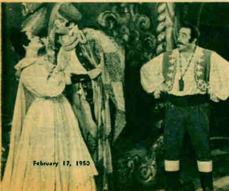
▼ SCENE FROM KTTV'S BUSTER KEATON SHOW has Alan going through a bit of funny business with the star while actor Ben Welden, as the prop man, looks on a bit dubiously. The video team of Keaton and Reed is one of the best on sets today.