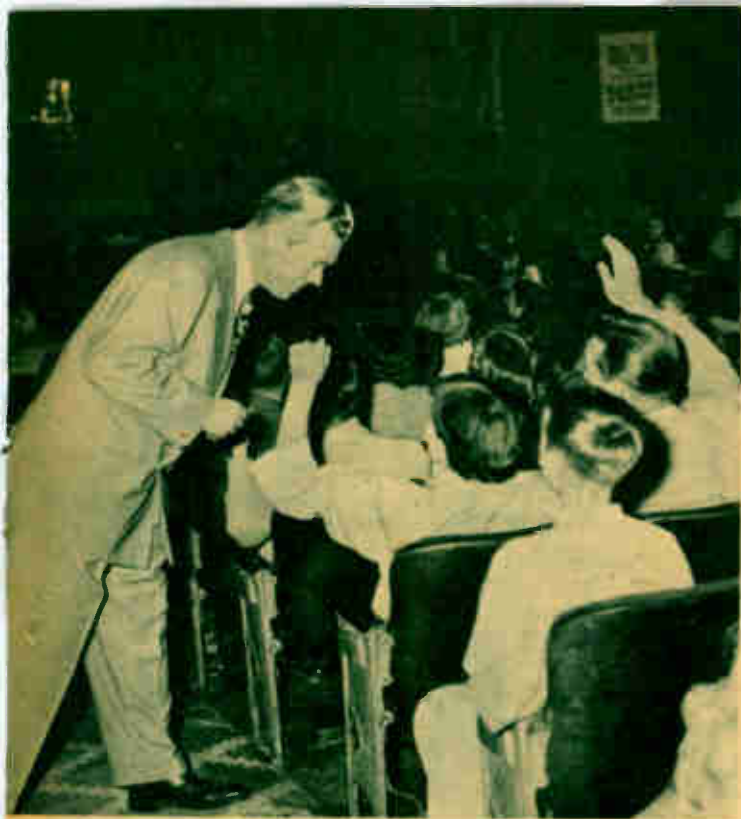
PICKING THE SIX CONTESTANTS at Pantages Theatre is a big job, as everybody is enthusiastic and sings with might and main to impress Bill in hopes of being selected to compete on stage. Nearly everyone gets the thirty-dollar prize.