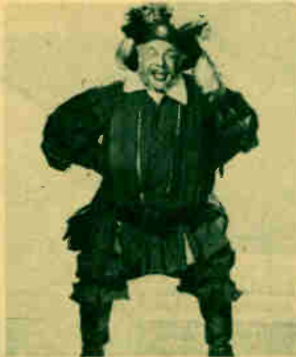
Alan Reed . . . Reed for a family name on his wife's side, and Alan, because of his eldest son.

So Alan decided to turn over a complete new leaf. He discarded his Teddy Bergman moniker, a name which had become so closely associated with a master dialectician that radio knew him by no other qualification, and changed into actor