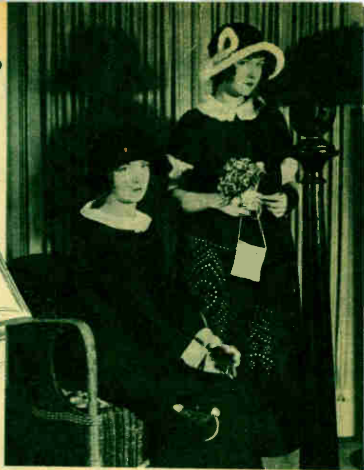
Publicity Photos of an Earlier Day Show Past History of Radio Programs and Stars

➔ THIS VIGOROUS SCENE IS PURPORTING to show the merry folks of radio going full tilt. Taken in the early twenties, the original caption reads: "Some sound devices of radio drama."