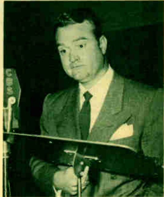
HOW SERIOUS can you get? It's a rare shot of the usually joyful Skelton that pictures this expression.