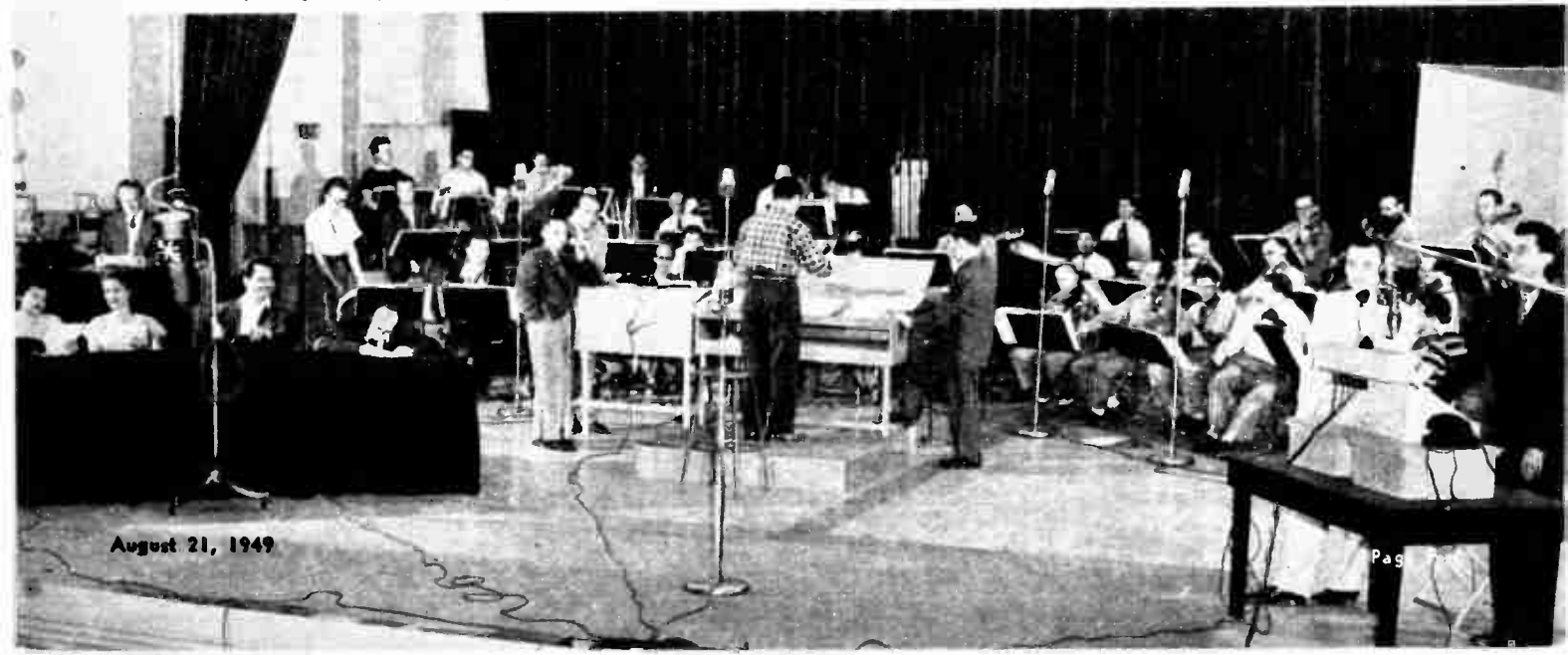
▼ THIS IS ONLY A SMALL PORTION OF THE STAFF NEEDED TO PUT THE HOUR-LONG SHOW on the air. Not present are the script girls; research workers who must dig out the information needed on stars and movies; writers who put together the clues that add up to entertainment; members of the singing group. Staff members estimate that more than ninety people a week are directly concerned with putting "Hollywood Calling" on the air.