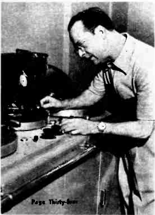
▼ A RECORDING of lava flow sounds too heavy and sluggish for an actively brewing bacteria culture.