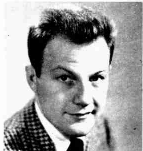
BURR TILLSTROM, WHOSE YEARS as a successful puppeteer belie his youthful appearance. Burr has to his credit some of the most popular show-time figures of all time, in his "Kukla," "Fran" and pals.