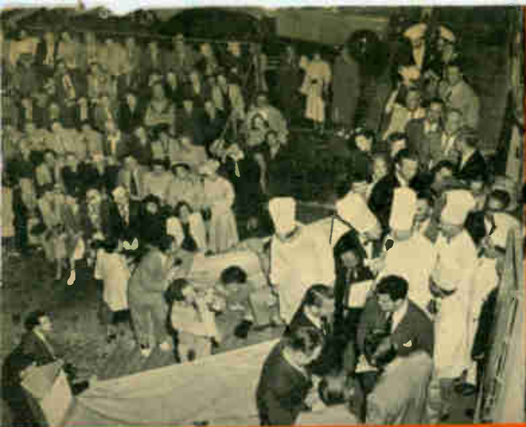
▲ UNIQUE PREMIERE USHERING IN JACK BAILEY'S BOOK "What's Cookin'" was (appropriately enough) held in a Hollywood super-market. Grandstands and klieg lights gave the affair a premiere's usual luster. Here arriving guests are interviewed by the "Queen for a Day" emcee herself.