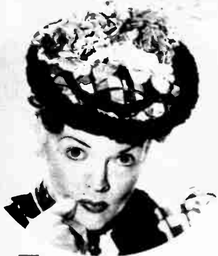
FRAN ALLISON as she appears in her "Aunt Fanny" role on Don McNeill's "Breakfast Club."