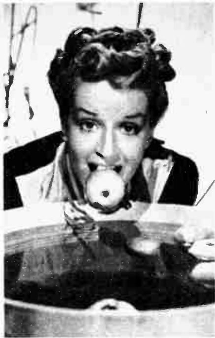
▲ PRETTY ROSEMARY DE CAMP of CBS's "Dr. Christian" show looks extra fetching as she pursues the old harvest-time sport of bobbing for apples.