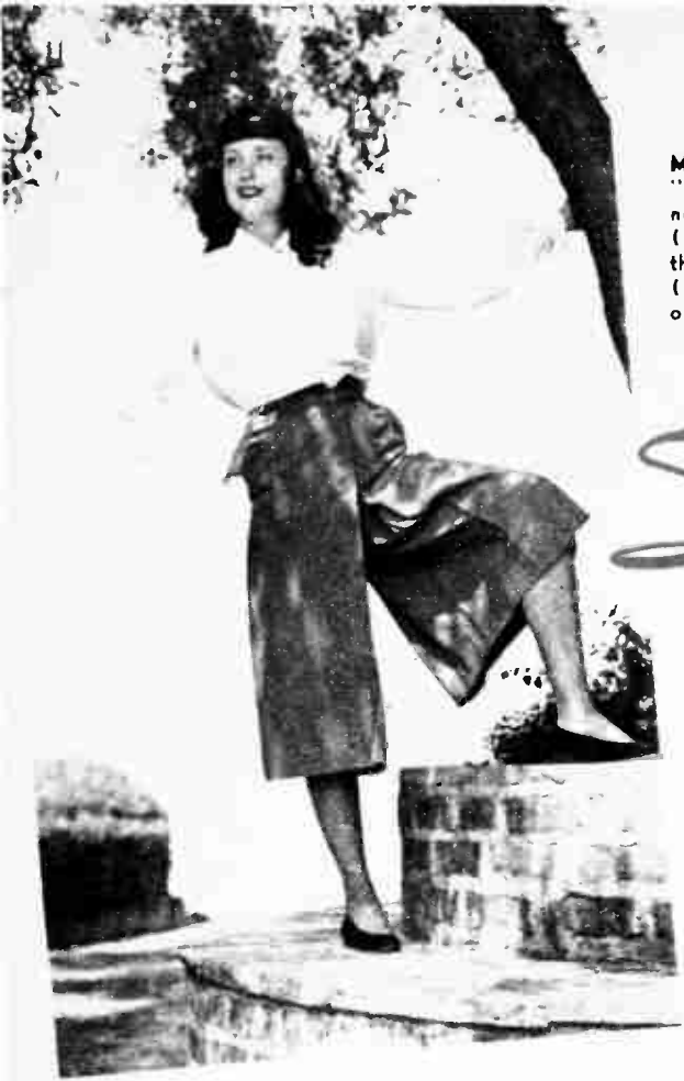
MARYLEE ROBB (Marjorie of NBC's "Great Gildersleeve") wears the new Dualottes. Zipped closed (right), they are neat enough for the office. Zipped up separately (left), you're ready for bike riding or bowling.