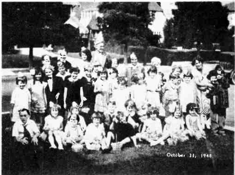
October 31, 1948