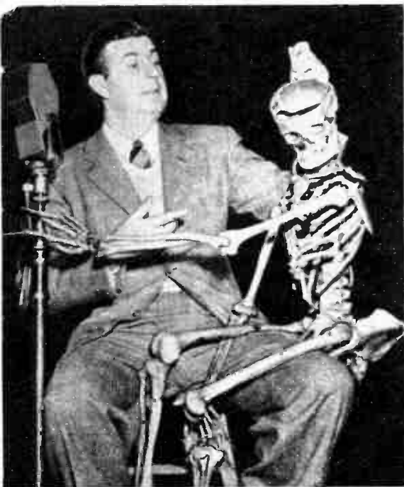
▲ DON McNEILL of ABC's "Breakfast Club" isn't afraid of spooks, hobgoblins, or even a bony old skeleton, which he here perches on his knee.