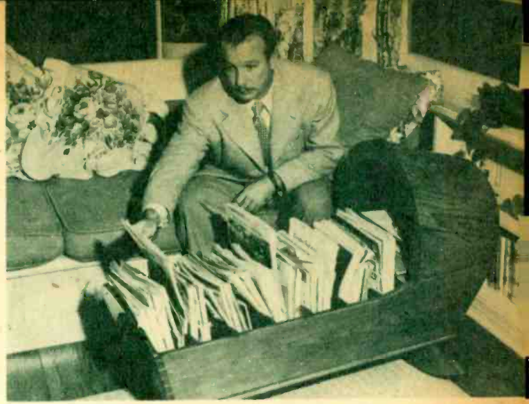
▲ IN KEEPING WITH THE DUTCH-Colonial theme of the home, a wooden shoe filled with ivy and a wooden cradle holding magazines decorate the den. This is one of Tuffy's favorite spots.