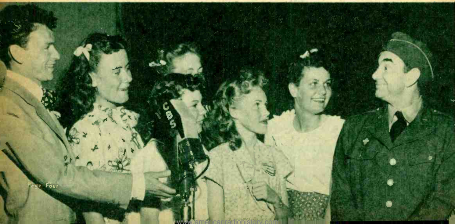
▲ WELL, WHADDAYUH KNOW! HERE'S FRANK SINATRA TURNING OVER his bobby-sox brigade to the Army's "Sad Sack" (a George Baker cartoon creation). The "Sad Sack" show took over Sinatra's CBS air-time for the summer.