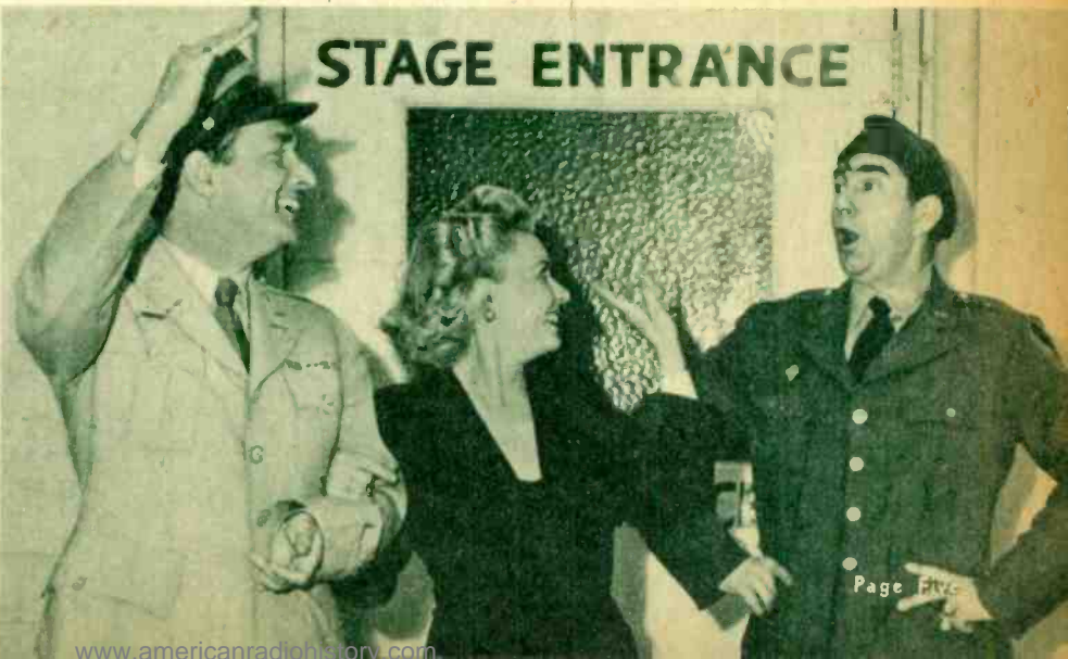
... AND JUST LIKE IN the "Sad Sack" comic-strip, the "brass" takes Betty and the "Sack's" left behind!