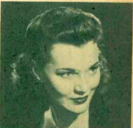
And the ballad chanteuse