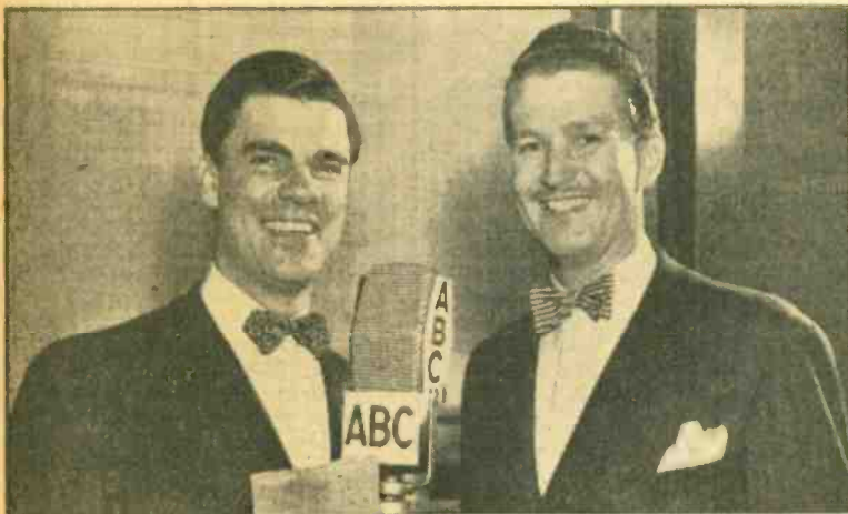
Bert Parks and Bud Collyer