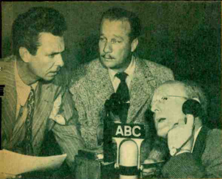
▲ FIRST VISIT OF GUEST STAR in more than three years was recently paid Lum and Abner's ABC show, when NBCComicaestros, Kay Kyser, was visitor. "The boys" thought he was Henry Kaiser, looking for an industrial site, when he actually was an amateur botanist out to collect plants.