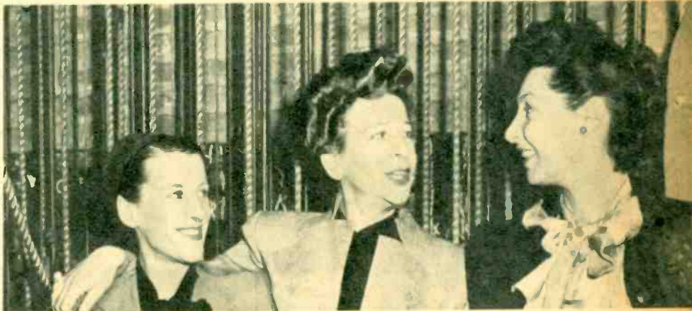
▲ BEA LILLIE, FANNY BRICE AND ILKA CHASE talk over old times during Fanny's trip to New York last year. Elsa Maxwell planned luncheon for the three, party soon totaled twenty-four!