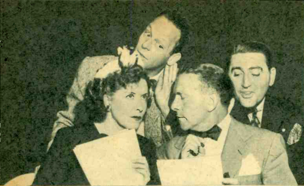
▲ "GUESS WHO WANTS George to help the Democrats run the country?", Gracie asks Bill Goodwin (left, above). "The Republicans", answers Goodwin. "Mr. Truman has a big problem all right", chimes in Meredith Willson. "He's fingering his bass wrong when he plays the piano."

have to buy a lot of new things. A person can't appear at the White House in old clothes.