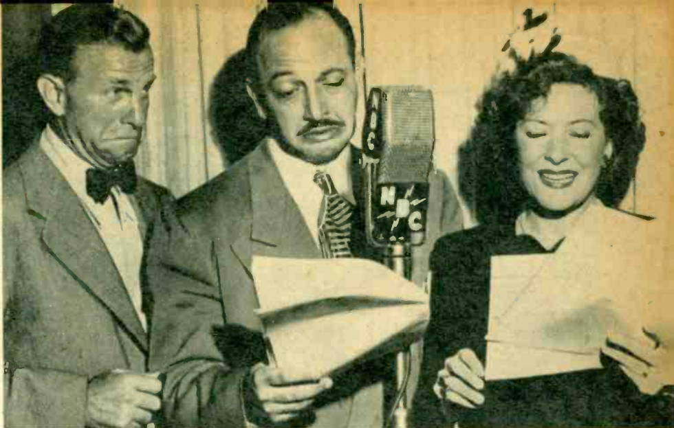
MEL BLANC, THE HAPPY POSTMAN, tells George and Gracie why he's so "gloriously alive"—"it isn't vitamins . . . I gave my wife a black eye. She tried to kick me and her shoe flew off and hit her in the eye!"

BILL: Oh come now. Things can't be that bad.