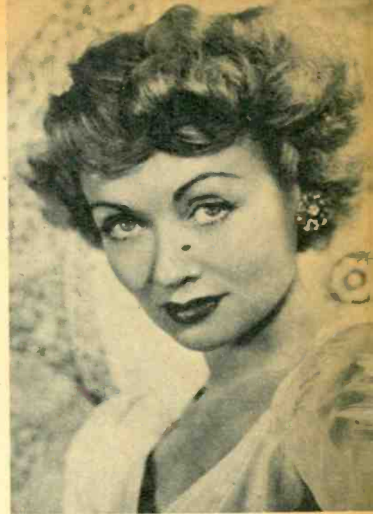
▲ CONSTANCE BENNETT is so busy that she hasn't had time to pose for publicity pictures for the past ten years. This is one of a series of her latest portraits.

Apologizing in her deep throaty voice for the delay, she graciously