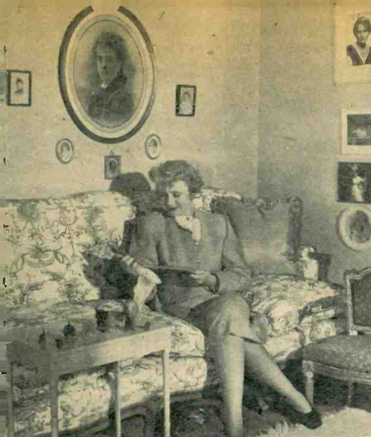
▲ THE ACTRESS HAS a real fondness for pictures and the walls of her Brentwood home testify to this liking. The circle above the davenport represents four generations in her family.