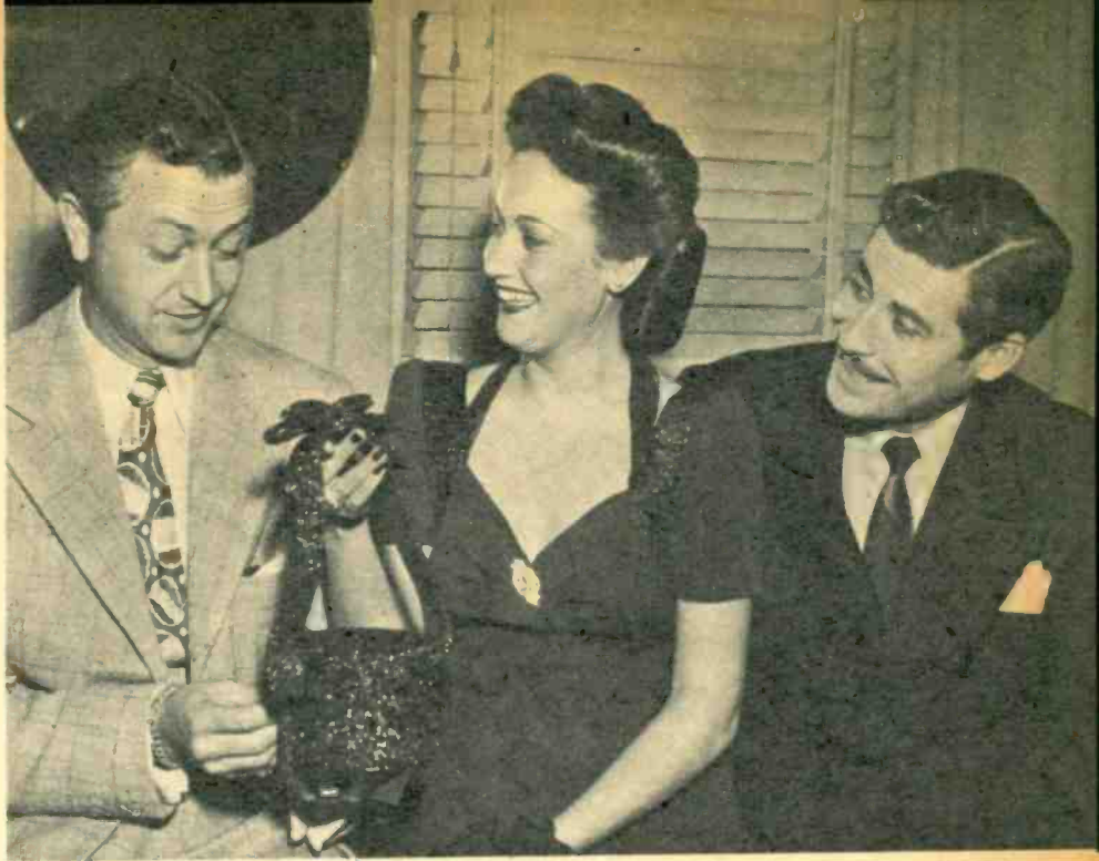
▲ BOB YOUNG AND JOHN HODIAK admire Dorothy Lamour's sequin handbag while waiting in the "Green Room" for air time. Because room is scene of so many exciting, humorous incidents, Don Ameche has re-named it "The Laughing Gas Room."

treuse. Here, scripts are re-written; producers, directors and writers go into huddles, emerging with blood in their eyes and secretaries at their elbows. Here, players jab at their lines with stiletto-like pencils, while Dorothy Lamour balks at some such sentence as "Stalking through the shimmering sunshine," which she insists causes her to hiss. Photographers with flash bulbs catch everybody in candid camera poses and