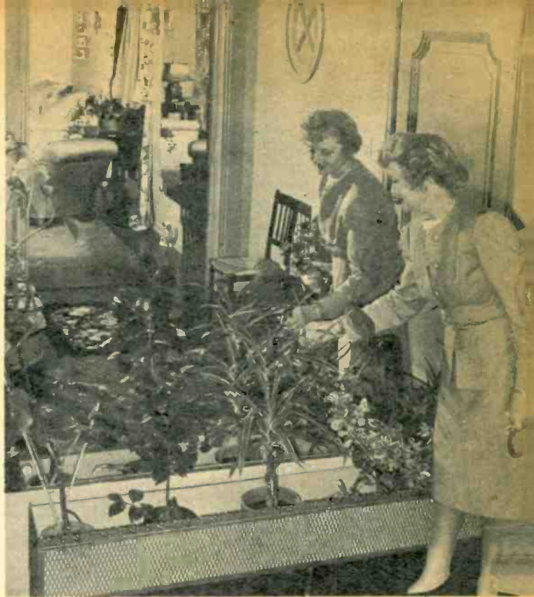
▲ SHE ALSO COLLECTS plants and alternates various ones in this effective display container in her entry hall. Her garden is collecting spot for miniature orange trees.

one Miss Burke used in her American stage debut, "My Wife," starring John Drew at the Old Empire Theater in New York in 1907. Sometime