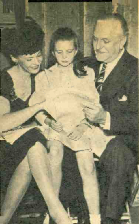
▲ GOING OVER THEIR scripts are Signe Hasso, Margaret O'Brien and Frank Morgan, who appeared in "Pied Piper."