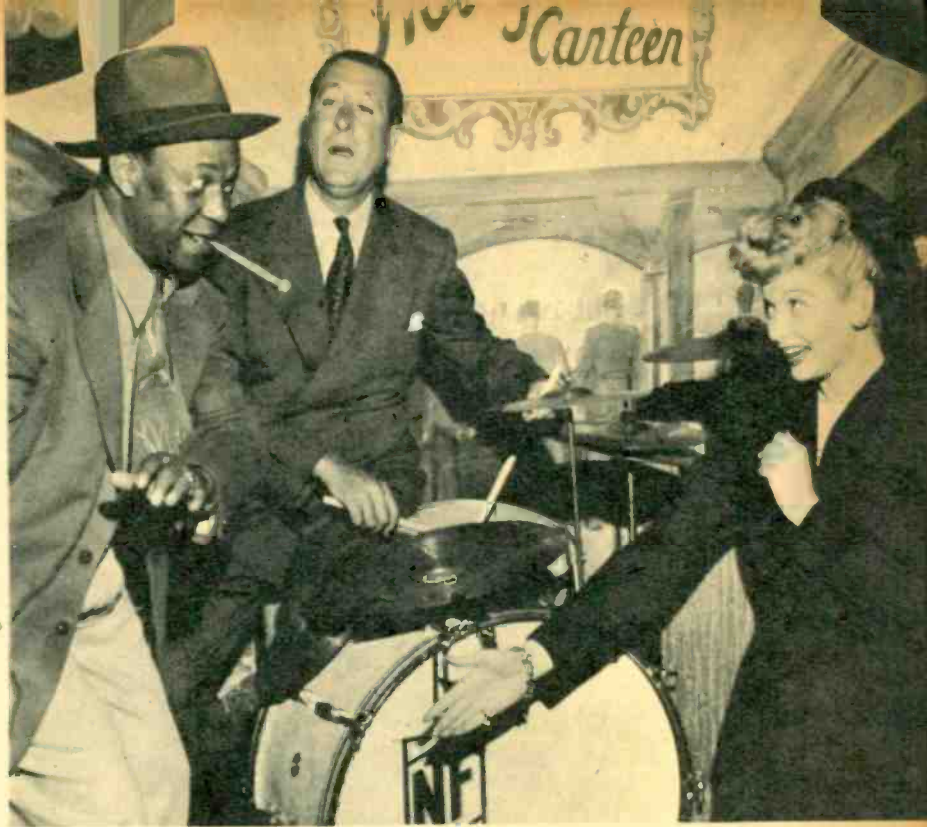
▲ RHYTHM, HOT AND LOW DOWN , when these three Journal stars collaborate. Rochester and Lucille Ball perform to the drumming of Arthur Treacher.