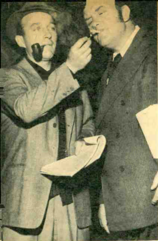
▲ BING CROSBY is another "editor" of the Journal, rotating the job with Bob Hope, Jack Carson, and Kyser. Andy Devine becomes a frequent staff member.