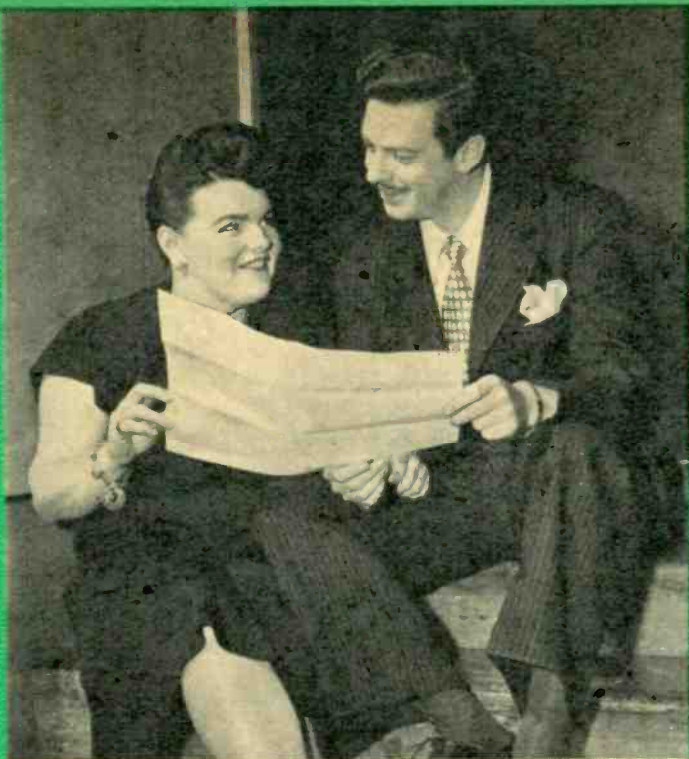
▲ SOPRANO EILEEN FARRELL AND Baritone Earl Wrightson are holding down summer spot on CBS's "Family Hour," Sundays, 2 p. m.