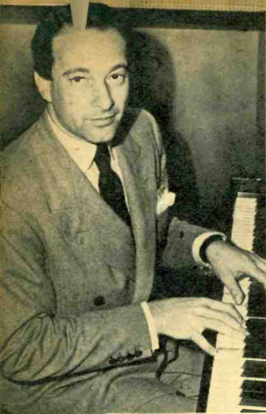
VICTOR BORGE is a suave, dashing gentleman who has a way with Americans. You'll like his easy-going humor and enchanting sense of whimsy.