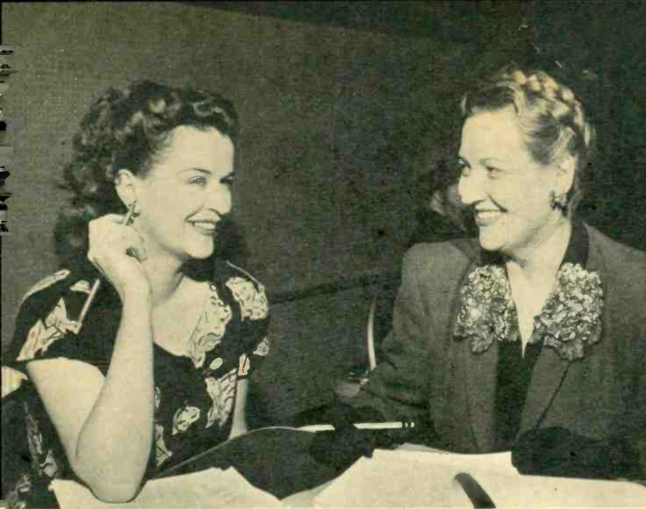
▲ AS THE GUEST of Verree Teasdale on "Open House," Rosemary laughed over the early incidents in her career when she considered herself "God's gift to the theatah." In college, she appeared in Shakespearean dramas, earned M.A. and B.A. degrees, recited poetry in her sleep.

Broadway," she was given a few laugh lines and some song-and-dance routines. Uncertain of her ability to deliver them, she practiced her tap steps behind closed doors on the tile bathroom floor so that her family couldn't watch her, and rehearsed her dialogue sitting up in bed at night after everybody else had gone to sleep. She had someone else do the singing for her on the screen because, in her own words, "I can't sing any tune but those I make up out of my own head." When she hums songs around the house, her little two-year-old daughter looks