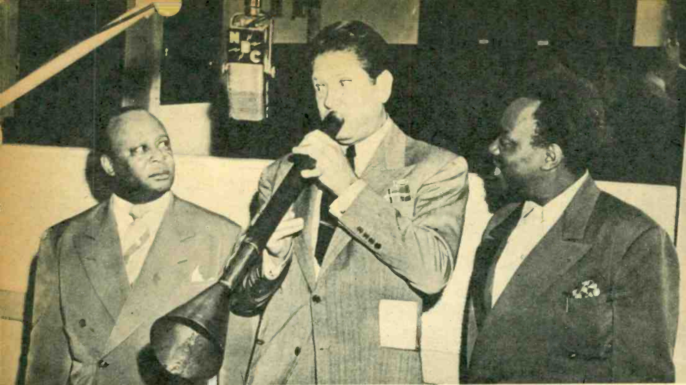
NEW COLORED COMEDY TEAM , Mantan Moreland, left and Ben Carter, right, look on with interest while their program star, Bob Burns, gives a demonstration on his famed bazooka.