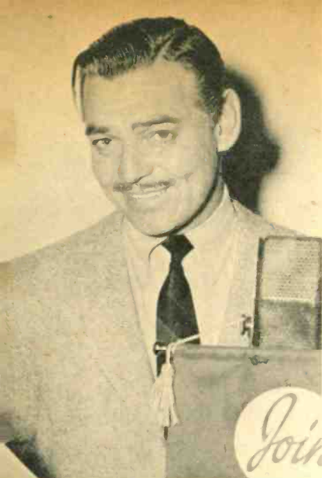
CLARK GABLE , again in civvies, makes a series of radio transcriptions which are being used this month throughout the country in March of Dimes campaign.