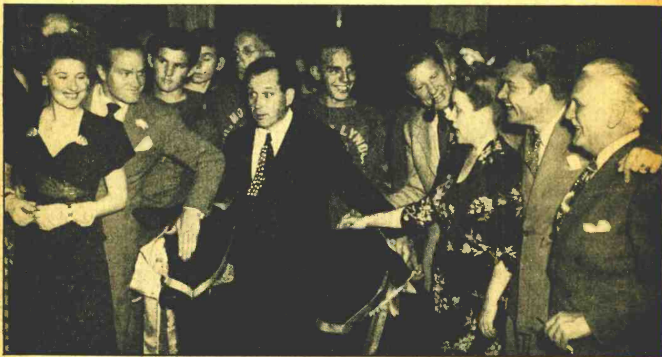
FIBBER AND MOLLY, at party celebrating start of their tenth year on NBC network for Johnson Wax, received a pair of prize Aberdeen Angus for their ranch. Left to right in foreground are Joan Davis, Bob Hope, Jim Jordan (Fibber) Bob Burns, Marian Jordan (Molly), Red Skelton, and Frank Morgan. See story in Radio West.