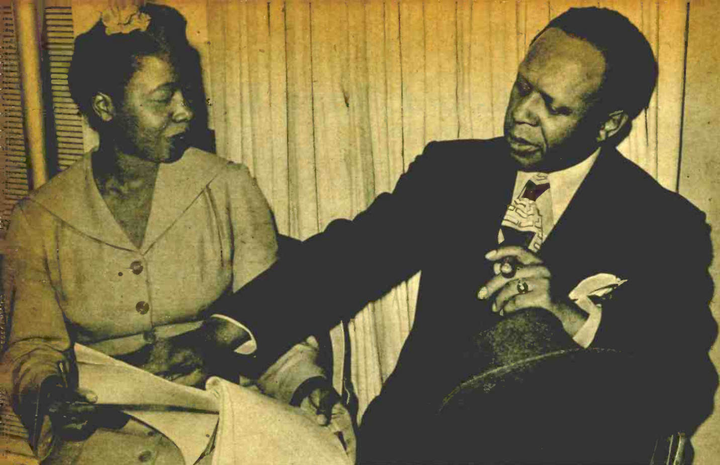
▲ SCENE-STEALERS on the Jack Benny show, Butterfly McQueen and Rochester go over their side-splitting gags together. Away from the microphone, Butterfly talks serious and intelligently of laughter as an art about which people still know comparatively little.