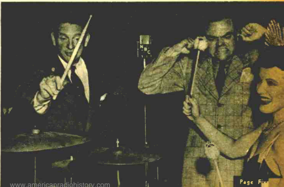
FUN RUNS RAMPANT during "Furlough Fun" rehearsals. Here Spike Jones plugs his ears and grimaces as comedian George Riley and beautiful Beryl Wallace give the "King of Corn" maestro a dose of his own mad music.

"Talking with the boys has become a most important part of my life," Beryl Wallace declared earnestly. The "Furlough Fun" femcee herself has three brothers who are now overseas.