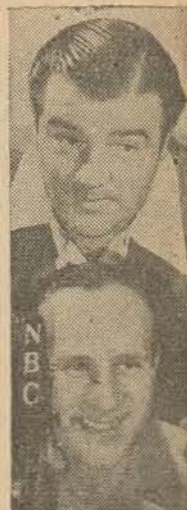
LOU COSTELLO BUD ABBOTT

Lou Costello left the air about 3 months ago suffering from an attack of rheumatic fever and Bud Abbott refused to continue their radio series without Lou—so, no Abbott and Costello. But, Lou is rarin' to go again, and you can expect plenty of that typical Abbott and Costello brand of comedy come next Thursday evening.