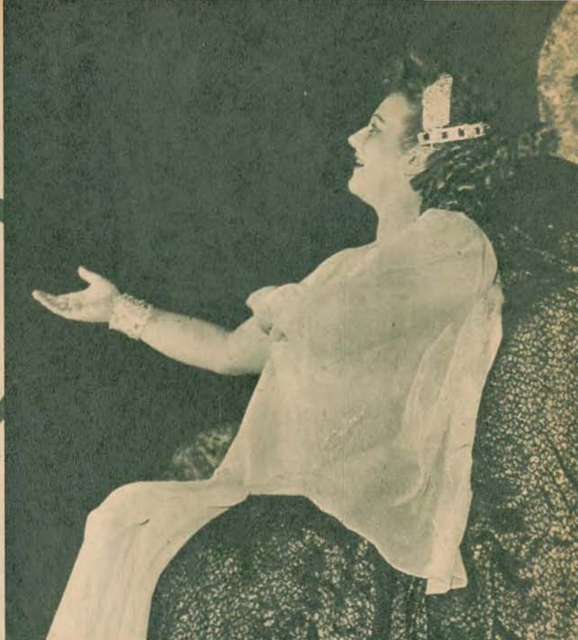
↑ MARJORIE LAWRENCE forgets her paralysis (and so does her audience) as she sings her comeback role at the Met—Venus in "Tannhauser." Note attractive couch from which she is able to perform, thus minimizing her handicap.

Even Paralysis Cannot Stop Marjorie Lawrence, Who Made Recent Comeback Via Kostelanetz' Program