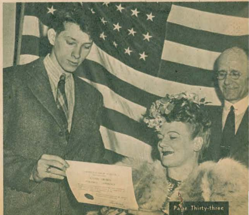
↓ IN HER WHEEL CHAIR , the noted Wagnerian soprano accepts a certificate of award voted by 5,000 Philadelphia boys. They considered her as best singer of the year "contributing most to musical education."

Her reassuring success in radio encouraged Marjorie Lawrence to try (Please Turn to Page 39)