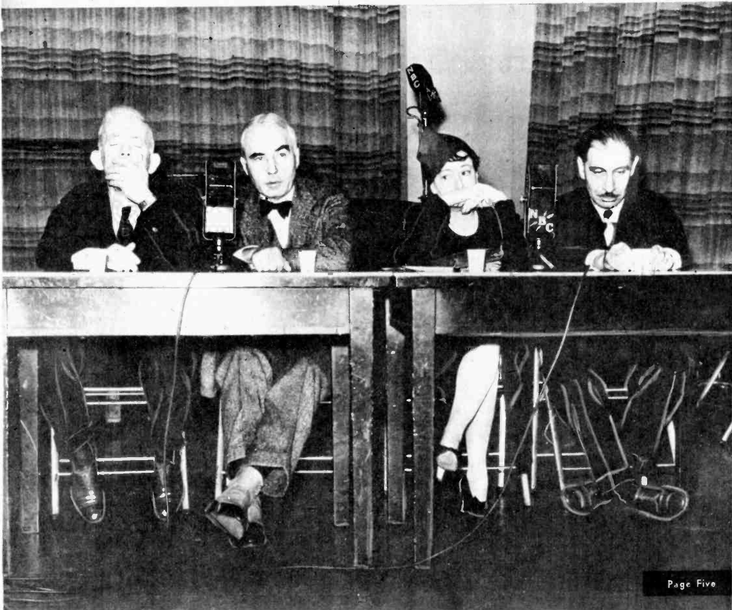
DOROTHY PARKER SITTING WITH board of experts. Left to right, John Kieran, Elmer Davis (also guesting), Miss Parker, F. P. Adams. Experts and guest experts have a scoring average of 75 to 80 per cent correct answers.

What did some of the other experts and guest experts say when they sat on the board of "Information, Please?" In the second installment of our article next week, we will tell more about this famous quiz show's best situations, together with some of the questions the experts have muffed. Be sure to read installment II.