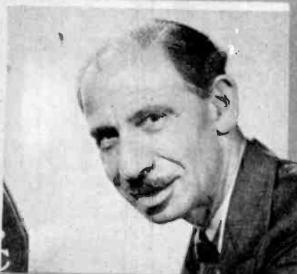
FRANKLIN P. ADAMS, LITERARY EXPERT, familiar also with old songs, Gilbert and Sullivan music, poker, pool, people. Likes to make puns.