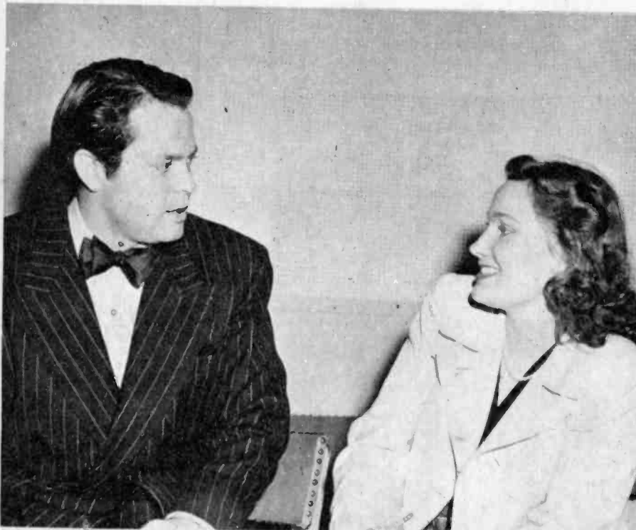
Page Thirty four