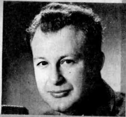
CLIFTON FADIMAN, POSER OF QUESTIONS. His ready wit underscores sensational answers, chides experts when they miss an easy one.