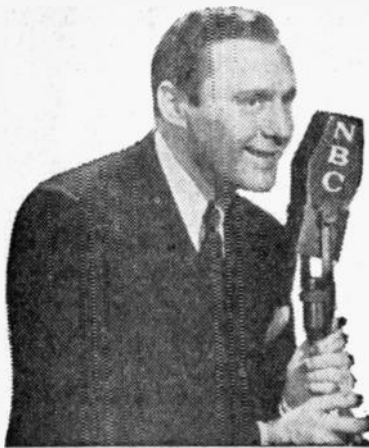
JACK BENNY comes back to fun and clown audiences into shuckles, October 5 on NBC's Red network—KFI.