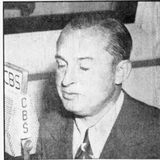
It's the Old Maestro, Ben Bernie himself, in person, back at the CBS mike again, five days a week in 15 minutes of "Just Entertainment."