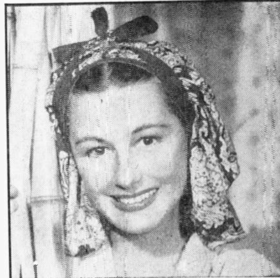
Beautiful Gladys Swarthout, star of the "Mel." on "The Pause That Refreshes on the Air." (KNX, 1:30 p. m., Sundays.)