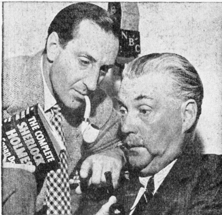
"The Adventures of Sherlock Holmes" returns to the air Oct. 5th over the NBC red network, featuring Basil Rathbone and Nigel Bruce. Mr. Rathbone is noted for his outstanding work on the stage and screen and for the past three years has added radio to his laurels by his adept characterization of Sir Arthur Conan Doyle's literary personality, "Sherlock Holmes." Mr. Rathbone is ably assisted by one of the nation's best character actors, Nigel Bruce, who portrays the part of Holmes' best friend and companion, Dr. Watson.