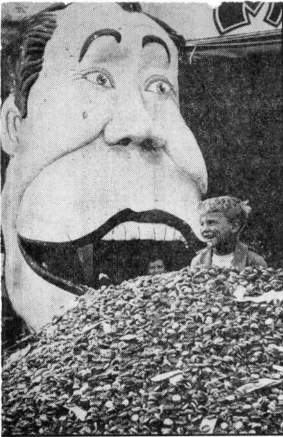
When beverage sponsors on Station KHJ Los Angeles announced they would give free rides on concessions in a nearby amusement park in exchange for caps from bottles, hordes of youngsters came trooping in with 270 thousand caps. Caps were piled clear up to the mouth of 'Joe E. Brown', comic plaster mask, on boardwalk at Ocean Park Pier.

stepped James Marlon Fidler, gong and bell-tapping air-critic of motion pictures.