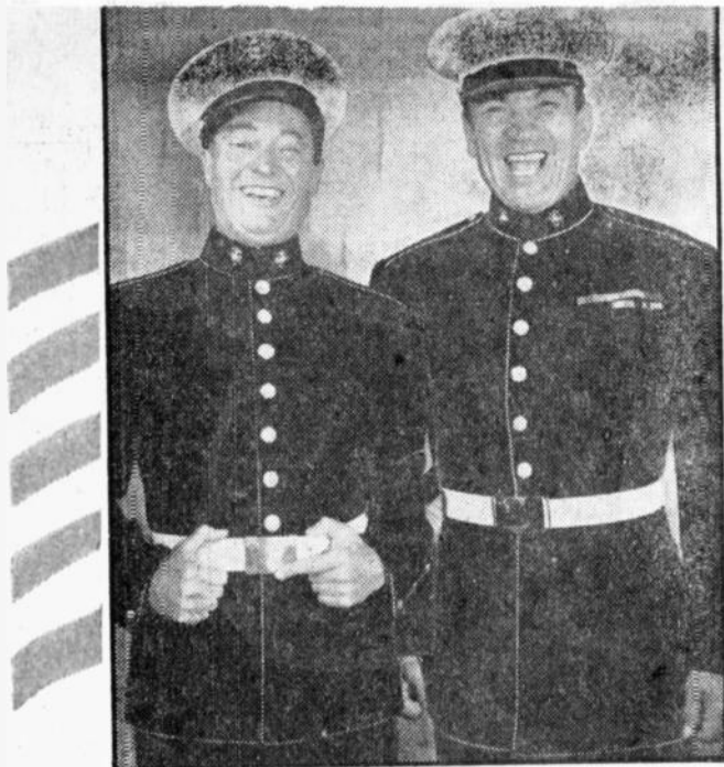
SQUABBLING MARINES, Victor (Capt. Flagg) McLaglen, (right), and Edmund (Sergeant Quirt) Lowe, come back to the vernacular wars, September 29 over NBC-Red network. KFI . . .

A S HEROES of that boisterous, lusty, woman-contesting, hard-bitten series, "Captain Flagg and Sergeant Quirt," Victor McLaglen, son of an English bishop, home-runawayer to war and World War I Provost Marshal of Bagdad, and Edmund Lowe, the San Jose high school boy and graduate from Santa Clara University, will be together for the first time on radio.