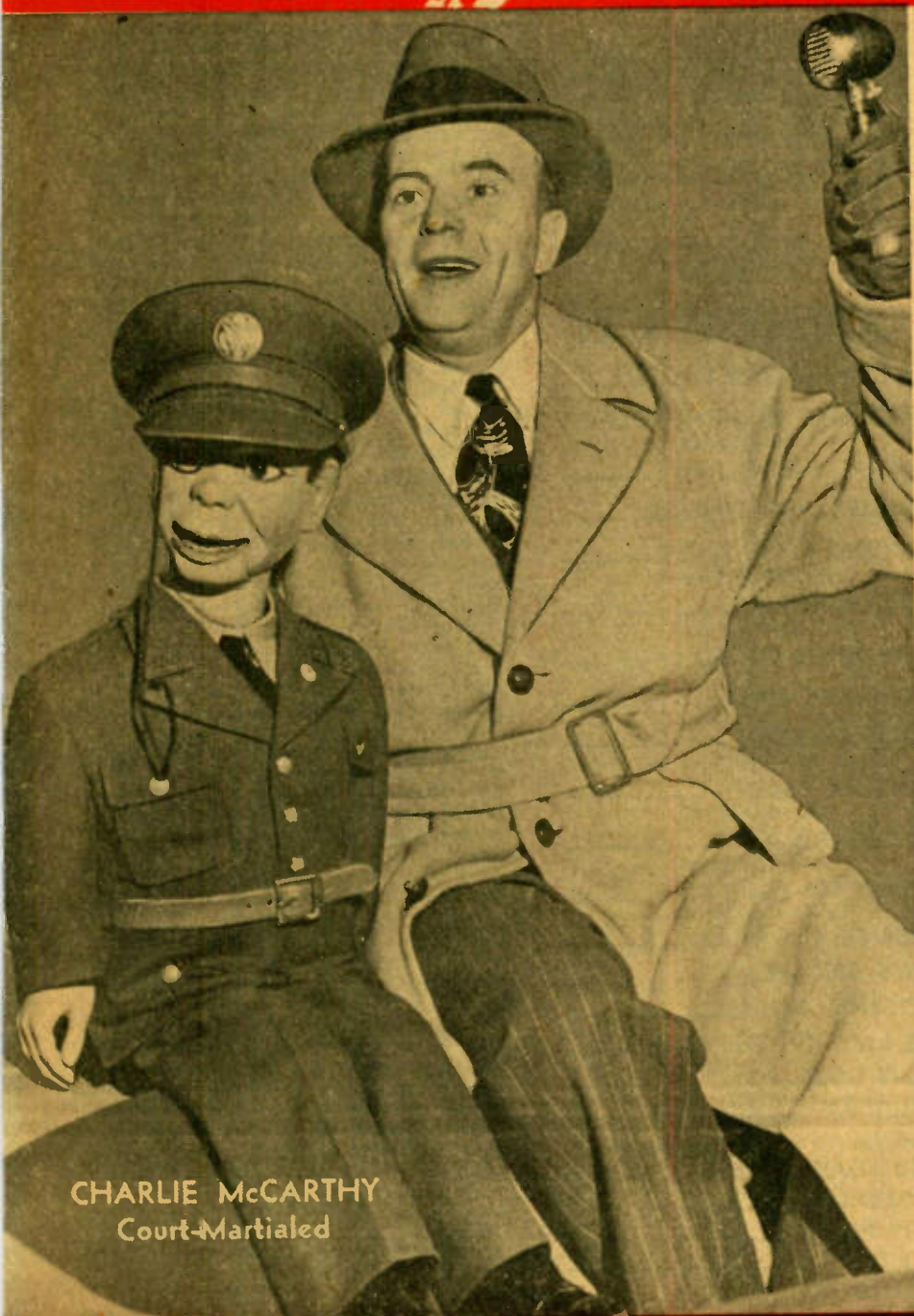
CHARLIE McCARTHY Court-Martialed