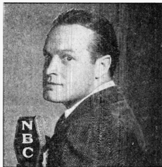
AND BOB HOPE, of course, September 23 the Pontiff of Peppodent returns with new situations, lines, gags and all around fun.