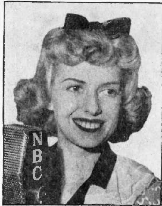
A girl with Socko in her Voice.

He left the studio, mopping his brow, and beaming. A radio quiz winner!