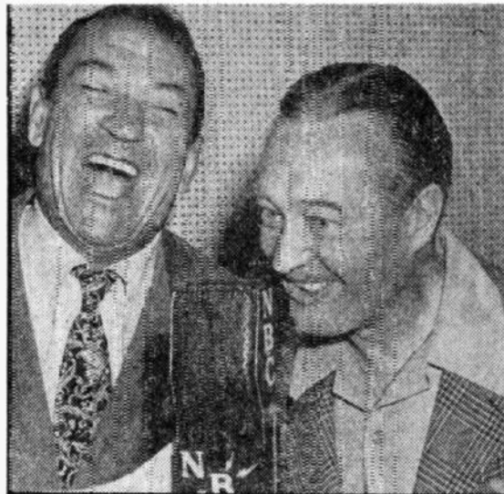
WHAT PRICE GLORY? To be found out over NBC, September 28 when Victor McLaglen and Edmund Lowe come together again in Radio's version of the famed motion picture play.

Closing Thought: The best way to take life is in little doses. Too much of it will kill one.