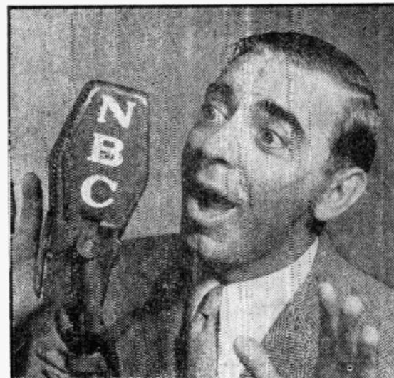
NOW ON AIR is Eddie Cantor, whose "Time To Smile" program comes back with renewed and freshened promise of an interesting winter season for this affectionately regarded comic and his listeners.