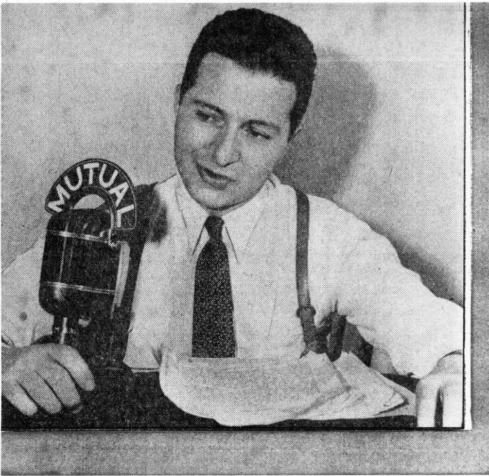
MAD AS A MARCH HARE, but as canny as a Scot is Henry Morgan. He has refined technic of satirical fun-poking at sponsors and programs to point where a witty insult pays off in the merchandising end.