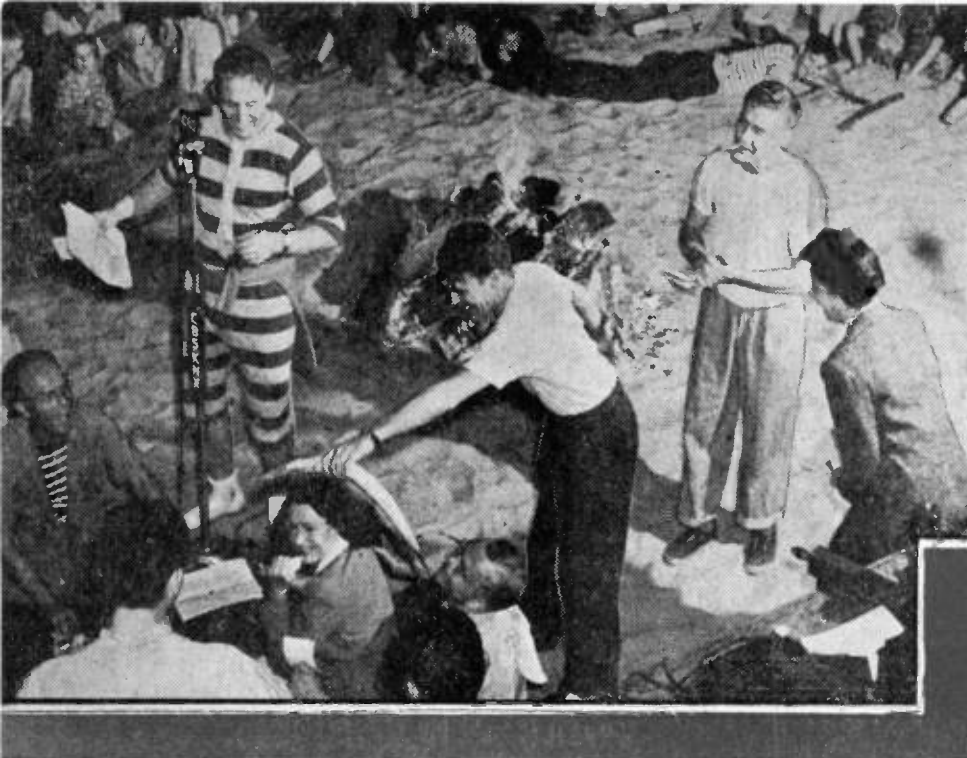
Art Linkletter (in prison clothes) brings an oil company's program to the beach. Hilarious as was the program it has been discontinued, allegedly because it was beneath dignity of the oil company. However, it was fun while it lasted.

Art Linkletter is interesting. As an ad-libber it is common belief in radio that he can talk his way out of most traps, because he has already fallen into every verbal manhole the mind of men can conceive during seven years of broadcasting from planes, boats, midways, rodeos, symphonies, man-in-the-street locations, stages and maternity wards.