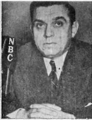
This is Raymond Clapper, distinguished Washington correspondent and NBC commentator.