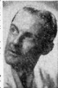
The Iconoclastic of the Air meets another emergency in his fighting career.