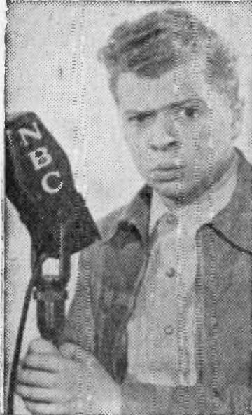
Youthful Ezra Stone is back in his familiar and popular role as Henry Aldrich, the irrepressible imp of "The Aldrich Family," on the NBC-Red Network.