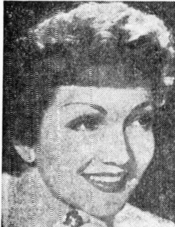
Claudette Colbert will have Jack Benny, Basil Rathbone and Edward Arnold as company on the Oct. 20 "Screen Guild Theater" over CBS.