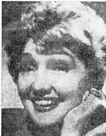
Hedda Copper, pictured here, is heard Mondays with "Hedda Hopper's Hollywood" over CBS.