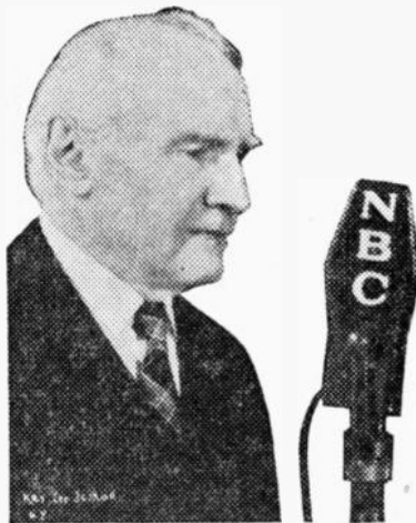
The NBC Music Appreciation hour, conducted by the famed Dr. Walter Damrosch, again will be released over stations on the Pacific coast beginning Friday, Oct. 18, when it will be heard from 11 a. m. to 12 noon, PST, over the coast-to-coast NBC-Blue network.

American unemployed, filthy tenement districts, grim poverty in land's corners.