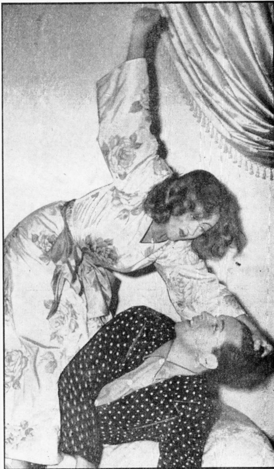
Here are Joan Blondell and Dick Powell in one of those cozy little home scenes with which so many of us are familiar. The picture is from the currently showing "I Want a Divorce" by Paramount, starring Joan and Dick, with Gloria Dickson, Frank Fay, Jessie Ralpa, Harry Davenport and Conrad Nagel.

her birthdays in different cities, every year, so widely did the Blondells travel; hence, when she signed her first movie contract Joan's first move was to buy a home from which she has not moved since