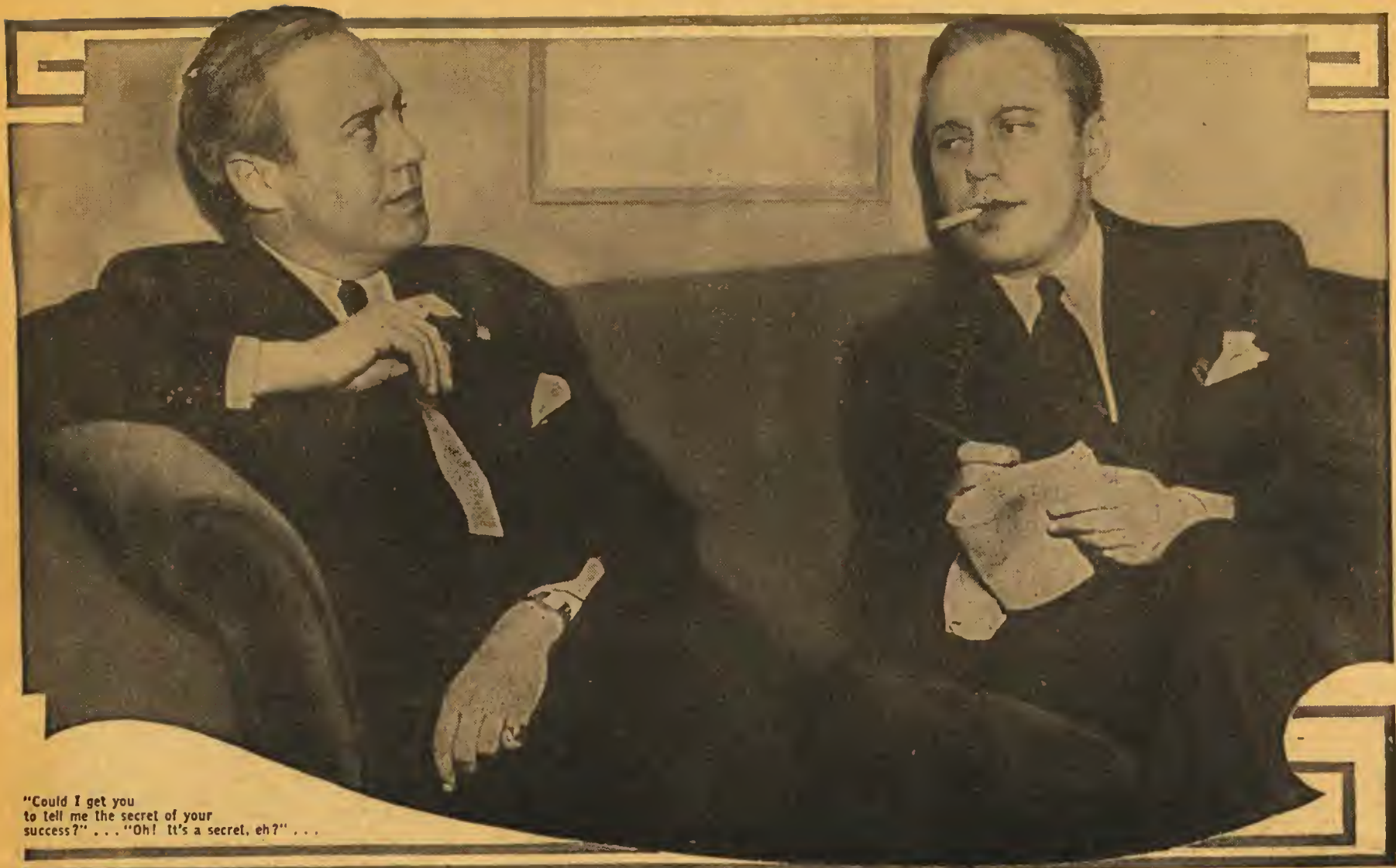
"Could I get you to tell me the secret of your success?" . . . "Oh! It's a secret, eh?" . . .