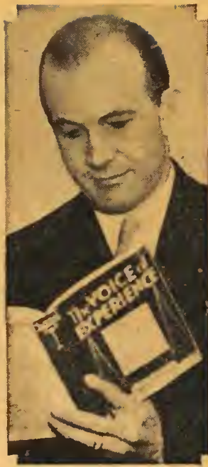
The Voice of Experience, who awards ten copies of his book, "The Voice of Experience," to readers whose solutions to each weekly problem are selected by him for special merit. All of the awarded copies of his book are autographed by him.

The new problem awaiting your solution follows: