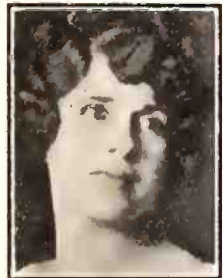
AIMEE SEMPLE McPHERSON