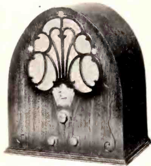
Philco Baby Grand

Recognition of the midget type of radio set by such an important manu-