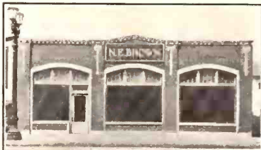
NEW OFFICE AND LABORATORY

to obtain larger quarters and increased facilities the second time within the last five years, and moving to the new building will begin August 18th.