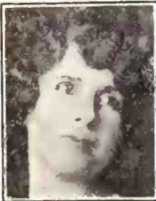
AIMEE SEMPLE MCPHERSON