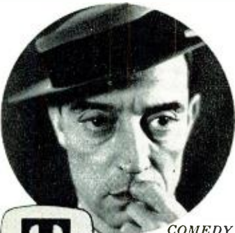
COMEDY CARNIVAL Hottest Thing on Reels

Governor Television Attractions 375 Park Avenue, New York 22, N. Y.