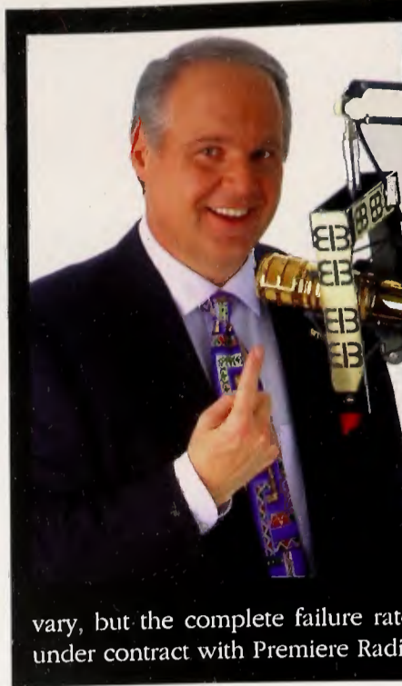
vary, but the complete failure rate is low. Limbaugh is currently under contract with Premiere Radio Networks through 2009.—CM