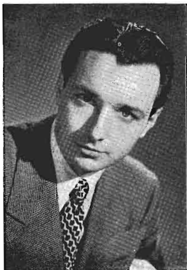
Radio Registry: PL. 7-0700