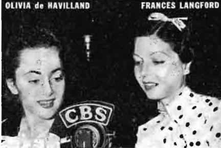
OLIVIA de HAVILLAND