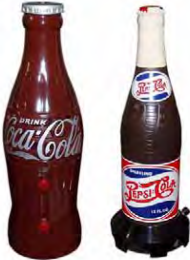
Coke and Pepsi bottle radios