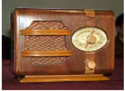
Sonny Clutter - Automatic Radio "Tom Thumb"