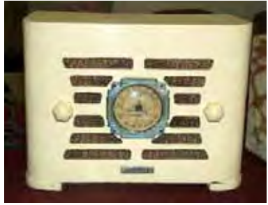
Jerry Talbott - Universal