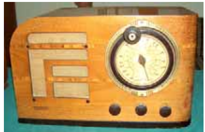
Art Redman - Philco 38-7