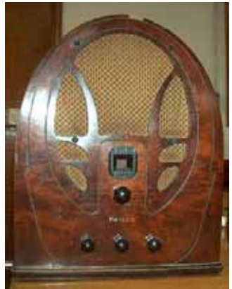
Myron White - Philco 66