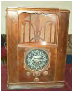
Cliff Tuttle- Zenith Model 27 Farm Set