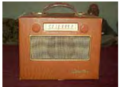
George Kirkwood - Silvertone Portable