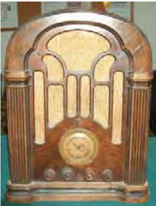
Liles Garcia - AK 206