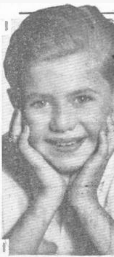
FRANKLYN ADAMS, youthful actor who plays the role of "Skippy" on the programs of the same name broadcast over the CBS-WABC network weekdays at 5.15 P.M.