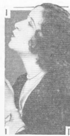
GRACIE ALLEN, in profile

A COUPLE of weeks ago a cabled item from London related the details of the annual funny-story-telling championship of England. It seems that every year a convention of comedians and humorous speakers gathers before an English audience, and each one tells one funny yarn. The one who makes the audience laugh the most is declared the winner.