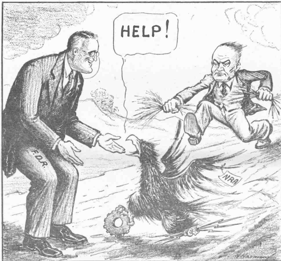
The Black And Blue Eagle

Circulation Manager. NOW, No. 34 Court Square, Boston, Massachusetts.