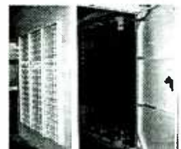
Model DL-300WP-4116EIA Rated for 450kW Continuous