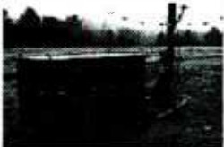
Model STM-AMAB-5K 5 kW All-Band Antenna Tuning Unit And Associated Telescopic Mast

Your No. 1 Source For AM Antenna Systems And Accessories In The USA And Worldwide