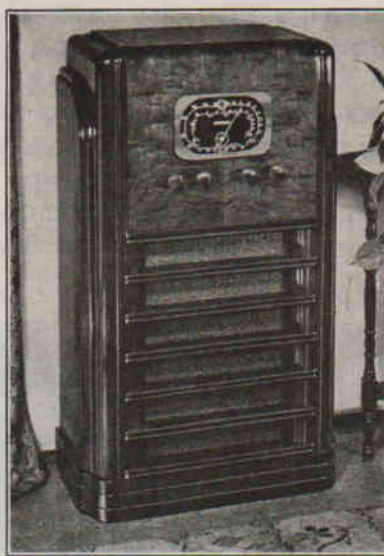
14 Tube Howard Model 425

Here is the Raja of manually tuned radios. Unless you go to push-button automatic tuning you aren't likely to find anything better at any price. With the exception of automatic tuning it has everything—will do everything—that modern engineering skill can produce. Yet, it is priced to save you a substantial sum.