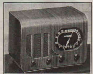
5 Tube Howard Model 225

Most important of its fifteen outstanding features is "Bass Boost" . . . a triumph of radio engineering. Its details are highly technical but its net result is a degree of fidelity never before attained in a radio operated at living room volume. It has push pull Beam Power output of 14 watts—more power than you'll ever need but important from a standpoint of tone. Covers three bands from 18000 to 540 kilocycles and brings in Foreign short wave stations almost as easily as it does American broadcasting. Edge lighted dial with figures that are really legible from a distance. Gold plated escutcheon. Electronic tuning eye. Huge 15-inch dynamic speaker that can "take it" when the power is turned on. The cabinet is in keeping with the quality of the mechanism inside, of course. Size, 41 inches high, 24 inches wide, 13 inches deep.