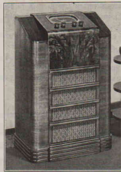
10 Tube Howard Model 325

You don't have to dig into your savings to buy this radio . . . Pocket money pays for it! Even if you already have a good Set you can well afford this model as an extra for kitchen, bed room, children's room, porch or office. Covers two bands—6500 to 2000, and 1700 to 540 kilocycles . . . Gives excellent performance on most of the popular short waves and regular broadcasts. Has Edge lighted dial, copper plated chassis, Tone Control, Dynamic Speaker. Attractive cabinet with quarter striped walnut veneer top and front. Bakelite knobs. Size 13 1/2 inches long, 7 3/4 inches deep, 9 1/2 inches high. Weighs only 16 pounds.