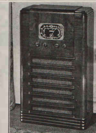
12 Tube Howard Model 400

It is possible here to make certain of getting the kind of a table model radio that will be in good style for years to come. No matter how many attractive "lay-down" small Sets are brought out, a beautiful upright model such as this will always be in good taste. There is nothing smarter on the market; or none that will give you better performance for the money. It has complete coverage of the short wave and broadcast bands—18000 to 540 kilocycles. Has Beam Power output, Edge lighted dial with gold plated escutcheon, copper plated chassis, Tone control, and Dynamic Speaker. Size 14 1/2 inches high, 13 inches wide, 8 1/8 inches deep.