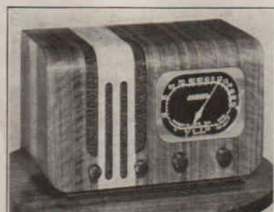
6 Tube Howard Model 260

This superb radio has push-pull Beam Power output. Three tuning bands (18000 to 540 kilocycles) cover all American and foreign short waves as well as regular American Broadcasting. New easy-to-read edge lighted dial in three colors. Electronic tuning eye tells you by sight when your station is properly tuned. 12-inch heavy duty Dynamic Speaker. Gold plated escutcheon. The most attractive cabinet of all radios employing this tuning arrangement. Size 35 1/2 inches high, 23 1/2 inches wide, 13 inches deep.