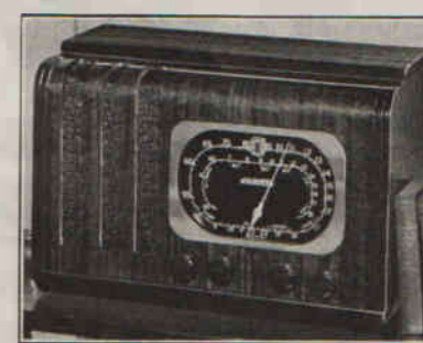
8 Tube Howard Model 368

Truly America's finest and most efficient 12 tube manually tuned radio! As you go over its many modern features you'll probably wonder why other manufacturers are compelled to get so much more for comparable quality . . . and no confidence will be broken by our telling you. In a comprehensive organization such as we have many manufacturing economies which have nothing whatever to do with the quality of the finished product have been worked out. For instance, we are able to make in our own factory many parts which go into a radio, and which other manufacturers must buy ready-made. Every component that we are able to manufacture under our own roof means a saving which is passed on to you, and Howard Radios come so near to being 100 per cent Howard made that the money you save on them is truly amazing! Just see what you get for your money in this model: Push pull Beam Power output, True Bass Boost, Three Tuning Bands 18000 to 540 Kilocycles, Separate coils for each band, Copper plated chassis, New Edge lighted dial, Gold plated escutcheon, Electronic tuning eye, Tone control, Heavy duty 12-inch Dynamic Speaker, and a massive cabinet of beautifully figured walnut veneers. Size: 40 1/2 inches high, 24 inches wide, 12 1/4 inches deep.