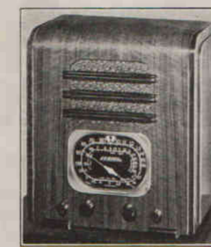
6 Tube Howard Model 275

With all the features we've built into this great new radio, no wonder our Dealers are pushing us to the very limit of our production to supply the demand. Others say it's a real triumph in value giving, but don't take their word for it . . . Go now to your nearest Howard Dealer and see for yourself what our more than sixteen years experience in building fine radios has accomplished. Quality that has made HOWARDS first choice among thousands is evident in every detail of this remarkable radio: Push Pull Beam Power output that provides more distortionless power than the very largest living rooms will ever require . . . Three Tuning Bands ranging from 18000 kilocycles to 540 kilocycles afford you complete command of all worthwhile foreign and American short wave stations, in addition to all regular American Broadcasting Stations . . . Electronic Tuning Eye for easier, more accurate tuning on all frequencies . . . Copper plated Chassis that will never rust . . . New edge Lighted dial in three colors with big numerals that are so easy to read. Huge 12-inch heavy duty Dynamic Speaker that easily handles the entire output of this tremendously powerful radio without overloading. Cabinet size 38 1/4 inches high, 22 inches wide, 11 1/2 inches deep.