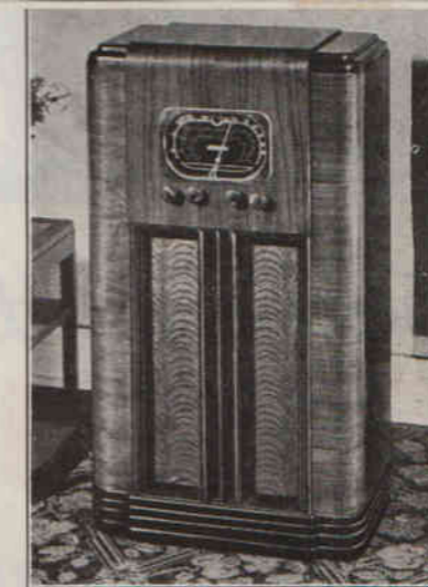
10 Tube Howard Model 318

With all the features we've built into this great new radio, no wonder our Dealers are pushing us to the very limit of our production to supply the demand. Others say it's a real triumph in value giving, but don't take their word for it . . . Go now to your nearest Howard Dealer and see for yourself what our more than sixteen years experience in building fine radios has accomplished. Quality that has made HOWARDS first choice among thousands is evident in every detail of this remarkable radio: Push Pull Beam Power output that provides more distortionless power than the very largest living rooms will ever require . . . Three Tuning Bands ranging from 18000 kilocycles to 540 kilocycles afford you complete command of all worthwhile foreign and American short wave stations, in addition to all regular American Broadcasting Stations . . . Electronic Tuning Eye for easier, more accurate tuning on all frequencies . . . Copper plated Chassis that will never rust . . . New edge Lighted dial in three colors with big numerals that are so easy to read. Huge 12-inch heavy duty Dynamic Speaker that easily handles the entire output of this tremendously powerful radio without overloading. Cabinet size 38 1/4 inches high, 22 inches wide, 11 1/2 inches deep.