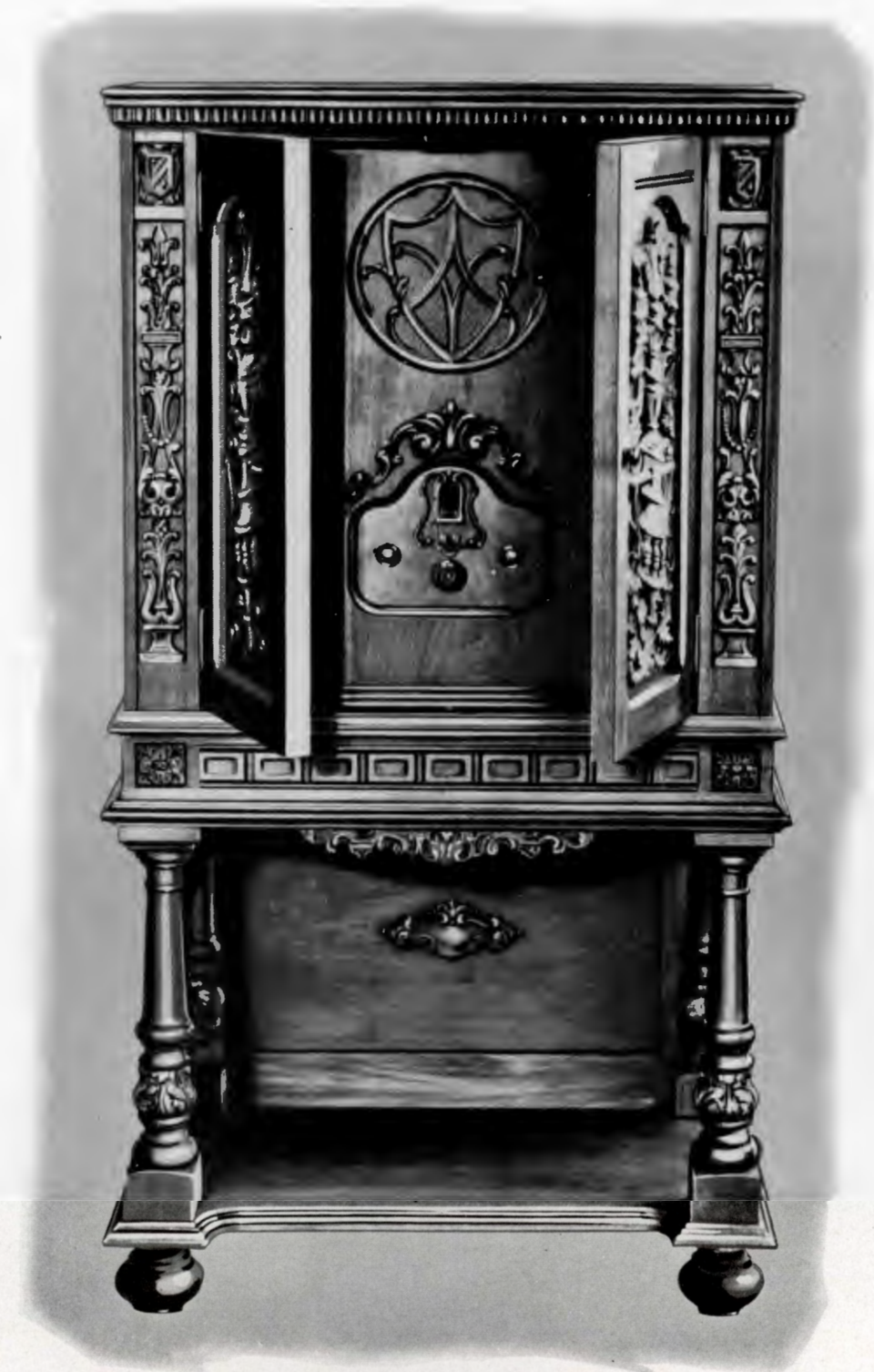
MODEL 301 (OPEN)