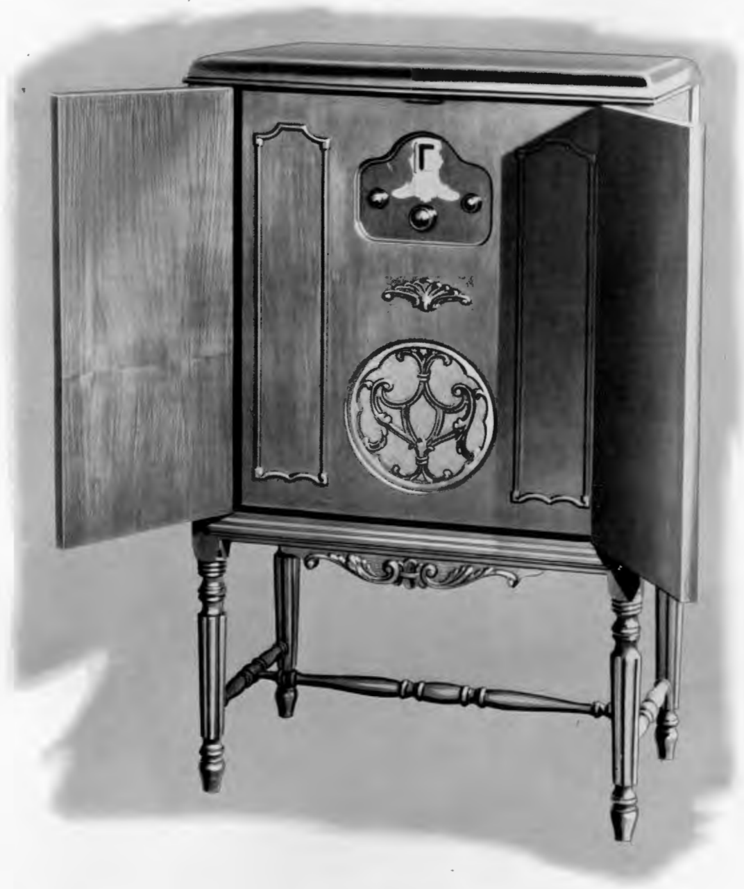
MODEL 931 (OPEN)