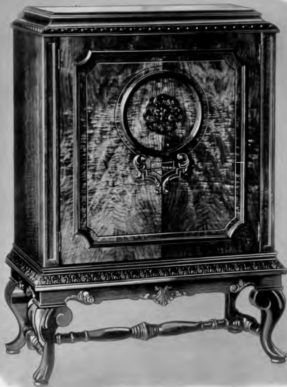
MODEL 110 (DE LUXE)