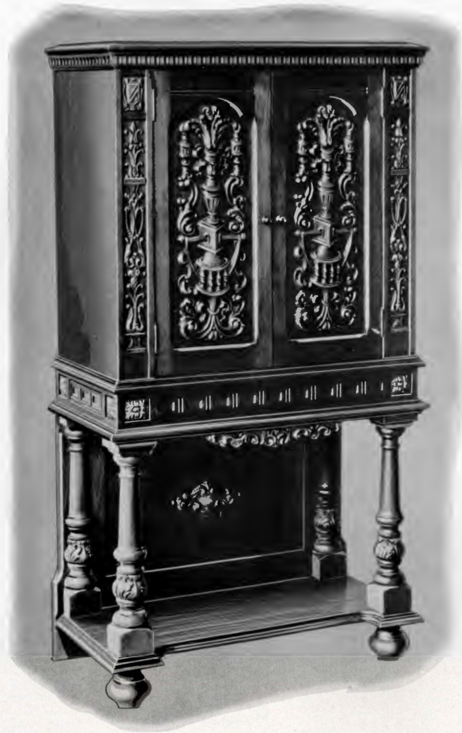
MODEL 301 (CLOSED)