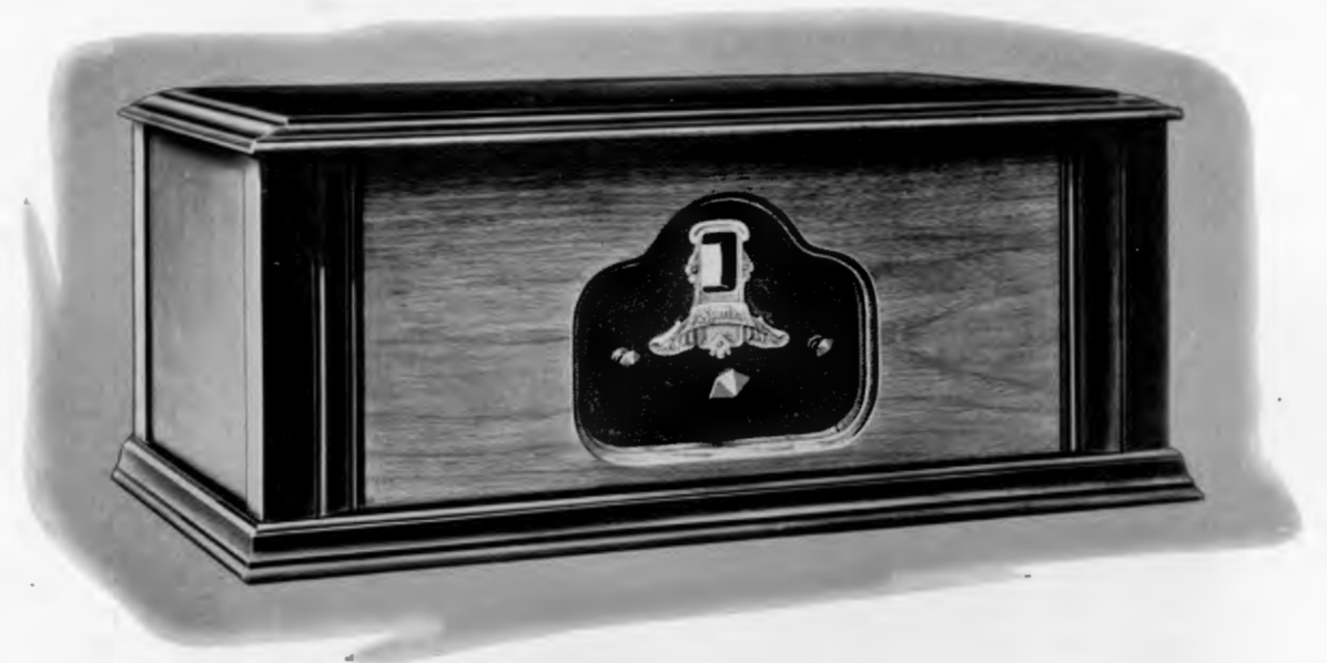
MODEL 49 (BATTERY OPERATED)