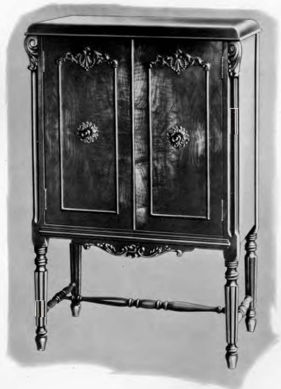
MODEL 931 (CLOSED)