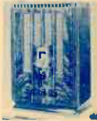
MODEL A-63 —Six-tube superheterodyne, completely equipped with new metal tubes. Two reception bands. Distasteful cabinet of built walnut veneer.