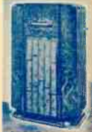
MODEL A-125 —Two-tube superheterodyne, with two broadcasting bands. New metal tube throughout. Non-tune cabinet in walnut.

(Photo-Action, Action in Real, 100 watt and Smaller in 100-watt and 100-watt)