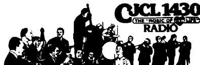
CJCL Radio, 464 Yonge Street, Toronto, Ontario M4Y 1W9 A Division of Telemedia Communications Inc.